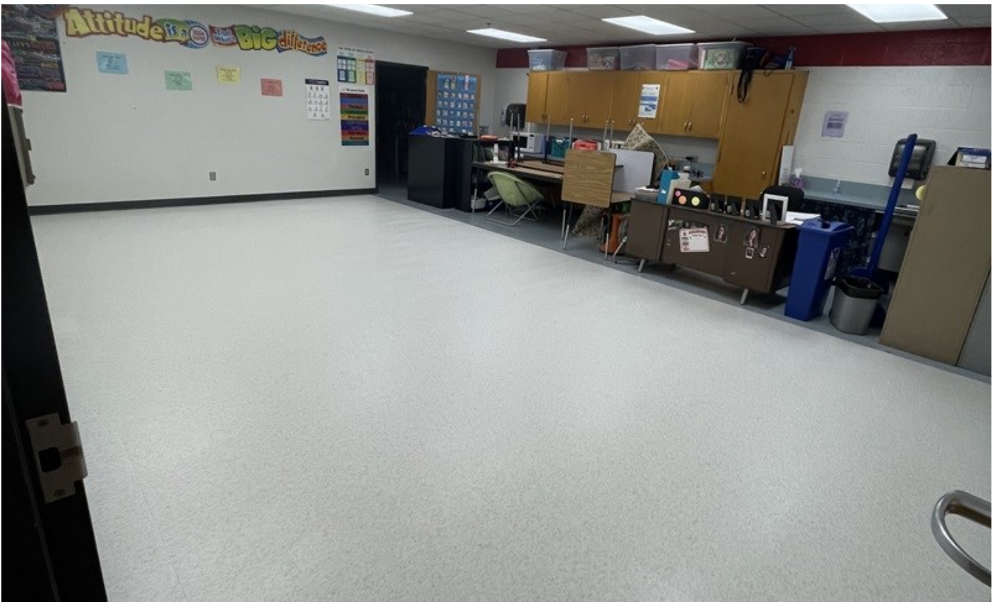
From top: New lights installed at the top of a staircase; new vinyl composite tile flooring (October 2023)