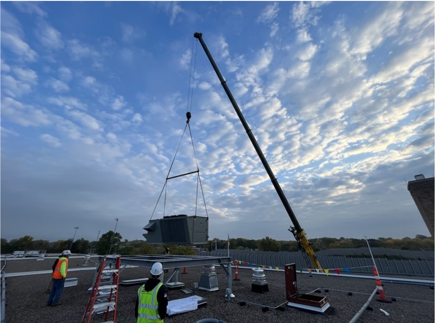
Rooftop air-handling units being lifted by a crane and set in place (October 2023)