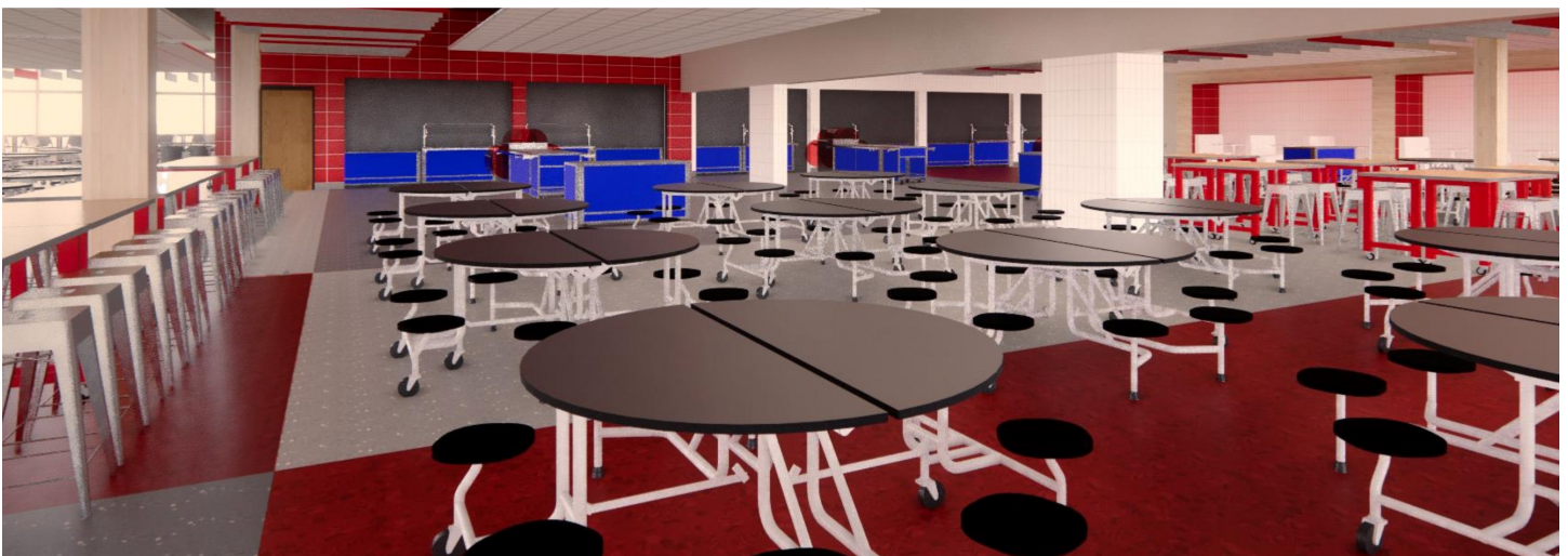
From top: Renderings of reception area, breakout and small-group rooms, and cafeteria