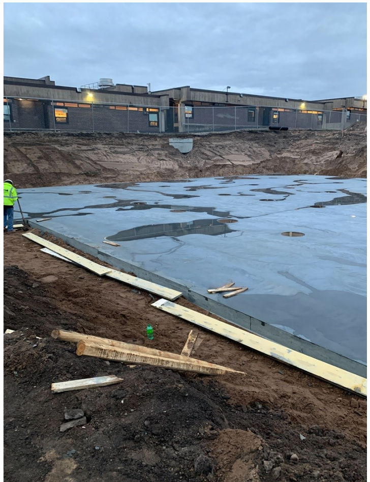
Top row: Buried utility lines; buried debris being removed; Bottom row: West underground storm water infiltration system being prepped and poured with concrete (October 2023)