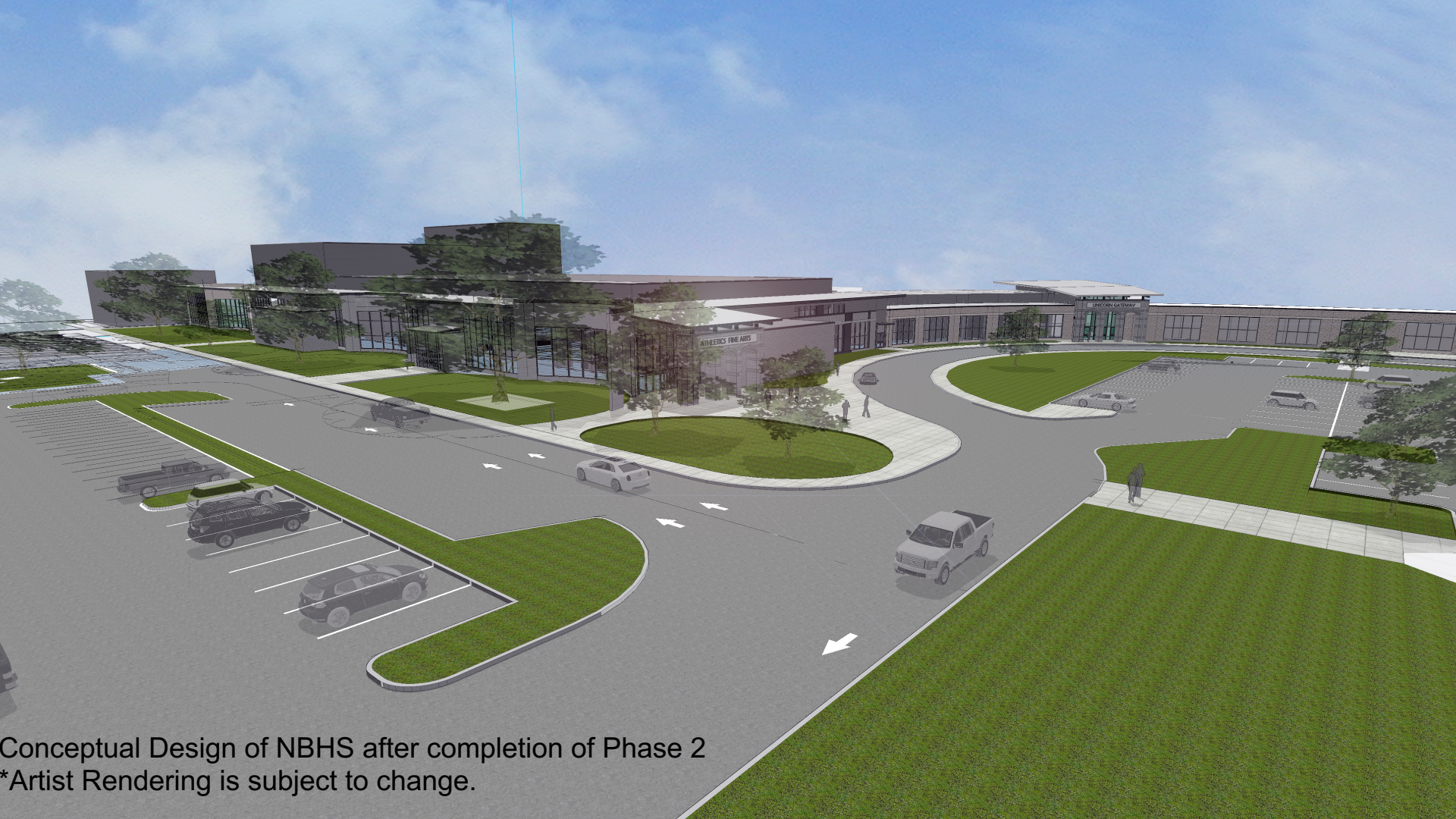
Conceptual Design of NBHS after completion of Phase 2 *Artist Rendering is subject to change.