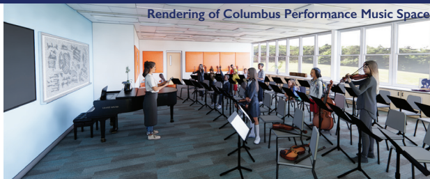
Rendering of Columbus Performance Music Space