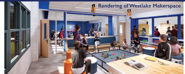
Rendering of Westlake Makerspace