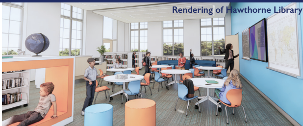
Rendering of Hawthorne Library