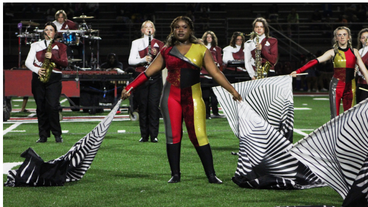
Above: This season's Marching Cavalier Band halftime show was a crowd-pleaser every time it was performed, and earned an "Excellent" rating at Bandmasters.