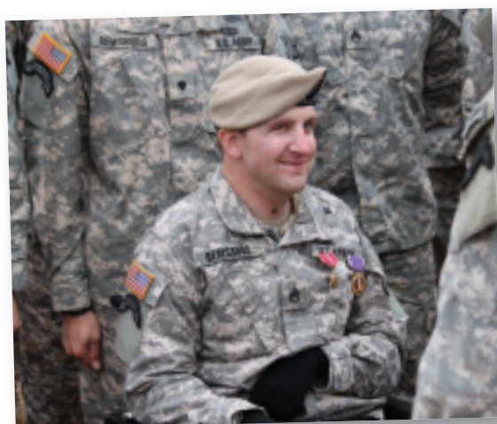
(Clockwise from left)