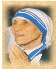
Saint Teresa of Calcutta