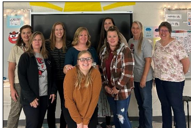
Elementary Educational Aides

The dedication and hard work of our Educational Aides do not go unnoticed. They are one of the pillars of our school, offering unwavering support to our teachers and students alike. Their presence in our classrooms and hallways makes our school a better place for learning and personal growth. We wanted to express our heartfelt gratitude for their commitment to our students' success. They are an integral part of the FLS family, and we couldn't imagine our school without them.