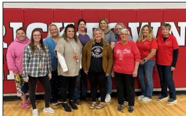
Middle & High School Educational Aides

Thank you to our Educational Aides, for all that you do for our school community. You are the unsung heroes who help our students reach for the stars! You are Appreciated!