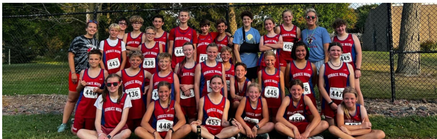
Horace Mann Cross Country Team, Sept. 5, 2023 at Marshfield Invite