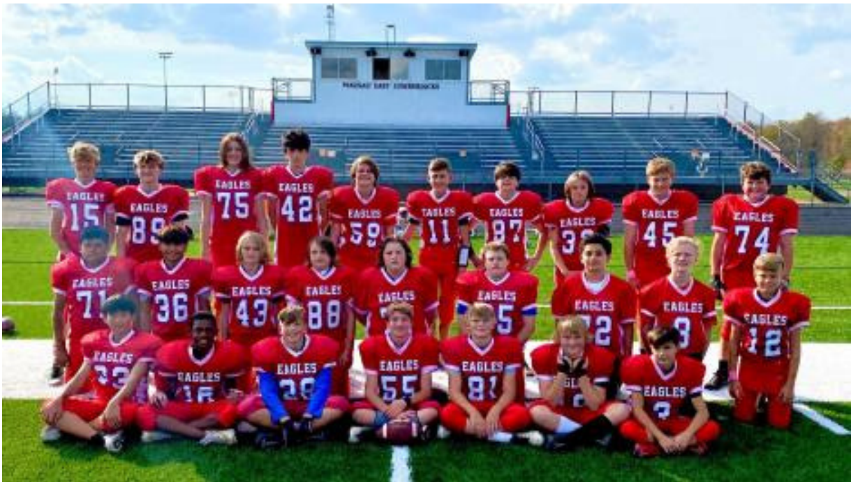
Horace Mann 7th Grade Football Team, October 3, 2023 at East High Stadium