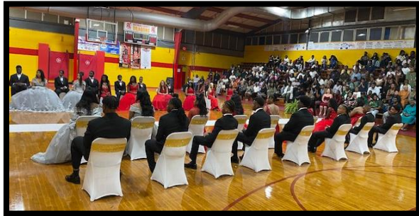
Quitman County Middle School Coronation