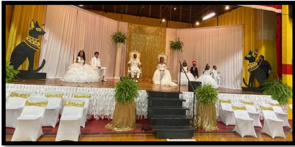
The highest court of the Elementary, Middle, and High Schools.