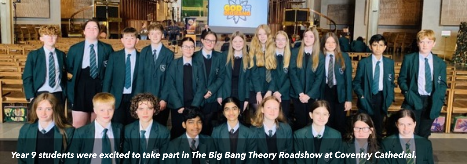
Year 9 students were excited to take part in The Big Bang Theory Roadshow at Coventry Cathedral.