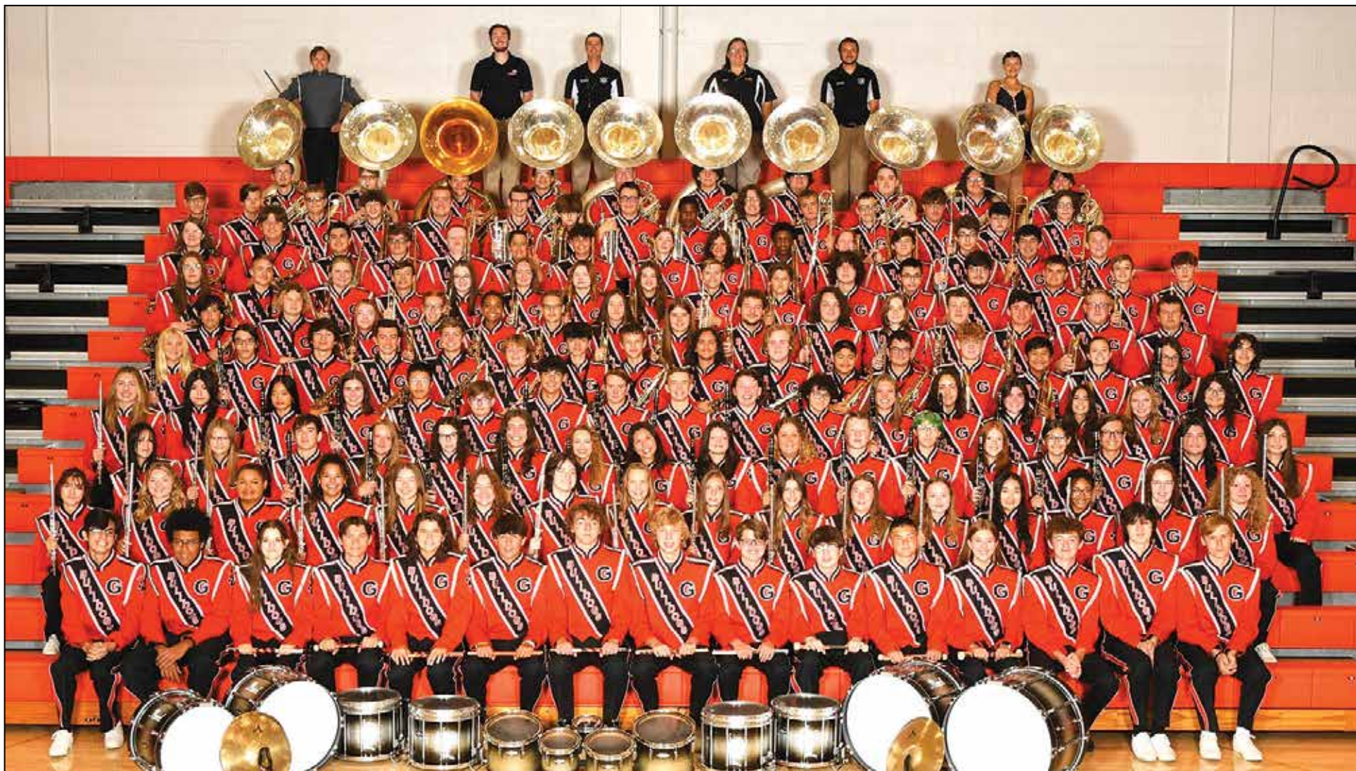
The GHS Marching Bulldogs performed at football games and hosted a Thank-You performance on October 10, 2023.