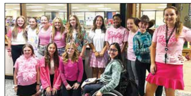
Barbie theme day at GMS

Homecoming Weekend 2023 was capped off with the 12th Annual Bulldog Dash. Proceeds from the 5K, mile fun run, and 200 yd dash benefit Green Primary School