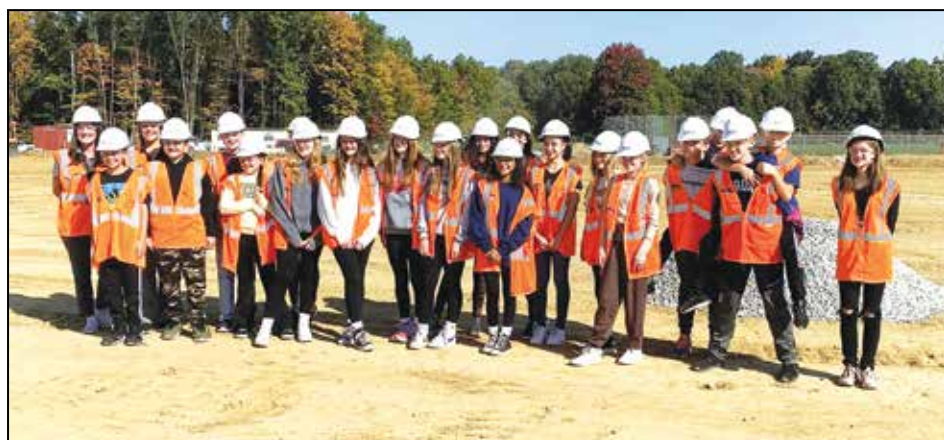
Seventh-grade STEM class at construction site.