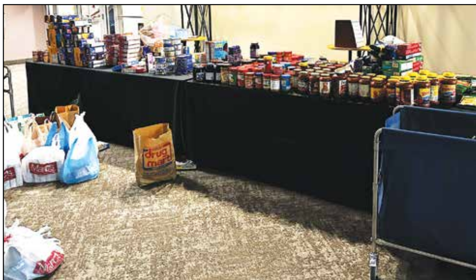
Chapel in Green donated 833 food items to the FSS program.