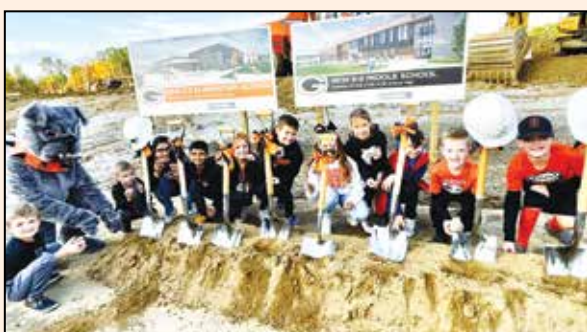
The new facilities groundbreaking ceremony was held on 10/20/23. See page 5 for Spotlight on Facilities.