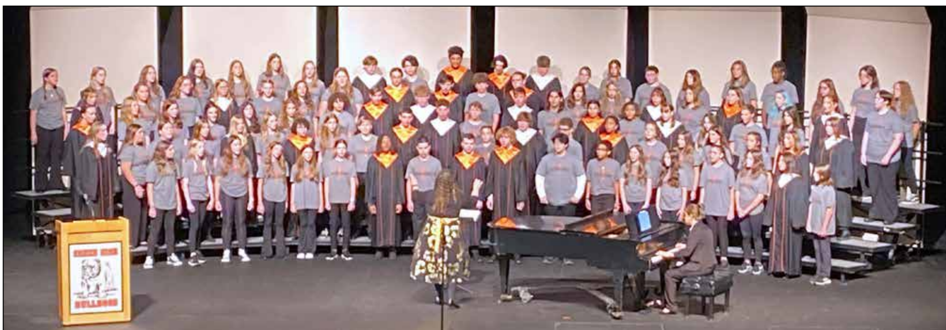
A combined GHS Select Choir and GMS eighth-grade choir performed on October 4, 2023.