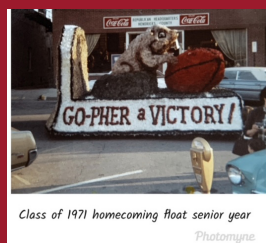
Class of 1971 homecoming float senior year Photomynce