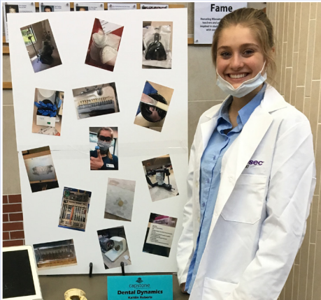
Students present their Senior Capstone projects at the Community Fair in the MHS Commons (from left, exploring sound engineering and the field of dentistry)