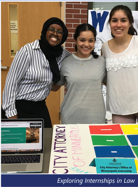
Exploring Internships in Law