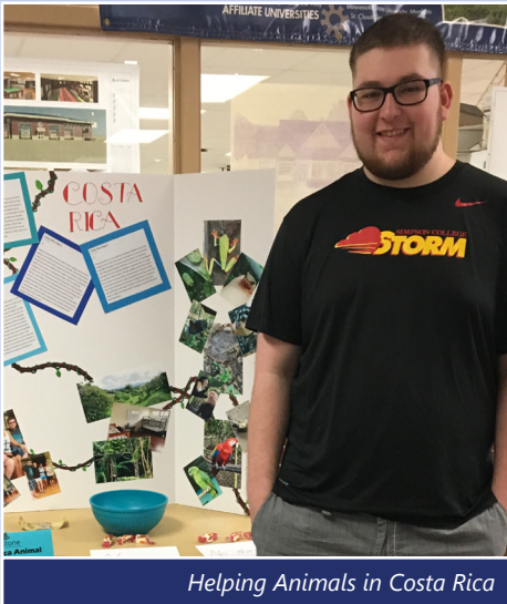
Helping Animals in Costa Rica