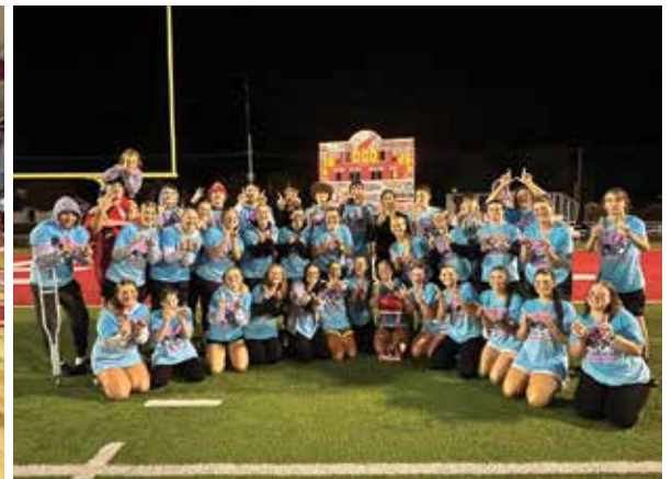
Our juniors square off against our seniors for our annual homecoming week powderpuff volleyball and football game.