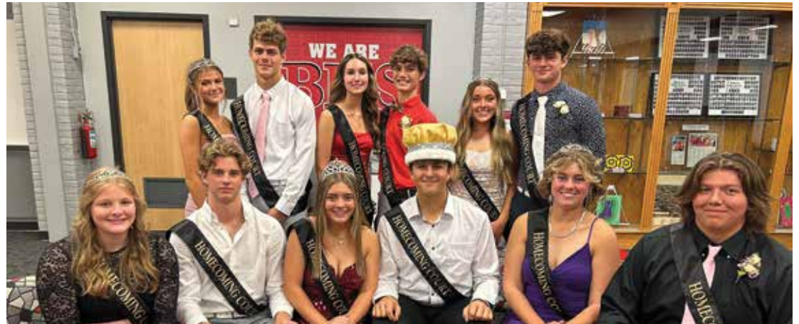
Drum roll, please! Congratulations to this year's homecoming court!

From Spirit Week with a Ken and Barbie and class color day, our homecoming football game where the Redmen band wowed the audience with Hollywood Blockbuster music and a visit from Superman, to a 60+ member alumni cheerleading squad and announcing this year's king and queen, this year's homecoming week was truly a "Red Carpet Affair." Thanks to our Student Council and all those who made the week one to remember!