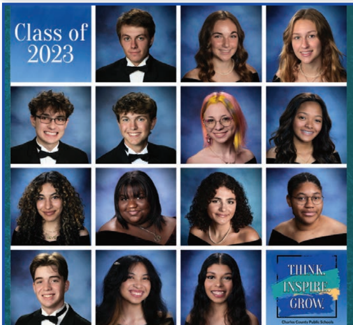
Pictured are the valedictorians and salutatorians for the Class of 2023. Read more about these class leaders on Page 39.