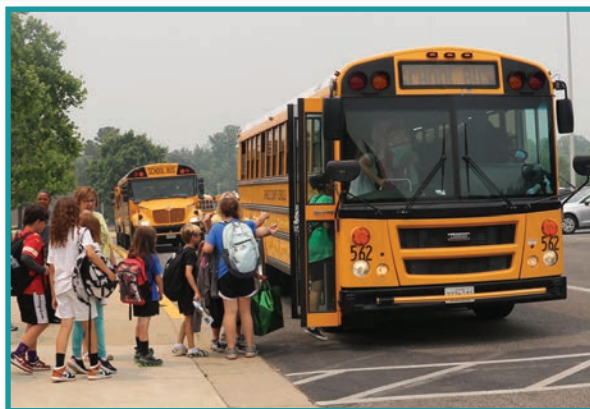
Students at T.C. Martin Elementary School line up to board a school bus at the end of the school day. Parents and guardians can download the Where's The Bus app. The app allows users to track the location of their child's bus while getting estimated times of arrival.

School Locator is an online system that allows the public to enter an address and see which three school zones — elementary, middle and high — an address is zoned for. The system also indicates if the address is eligible for bus service, what the bus number is and where the closest bus stop is located. School Locator can be accessed at www.ccboe.com under the Quick Links