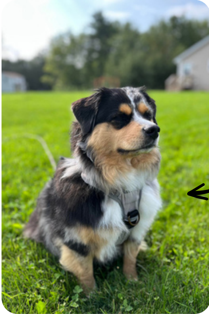
Left: Owen Tebbets' dog, Akua, enjoying some sunshine and fresh air.