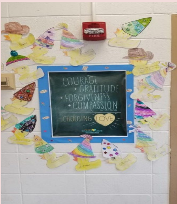
"Choose Love Formula" with ducks representing what choosing love means to our Extended Day Enrichment students.