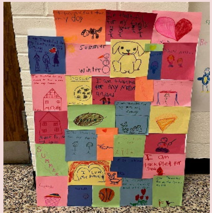
The Extended Day Enrichment students created a Gratitude Quilt.