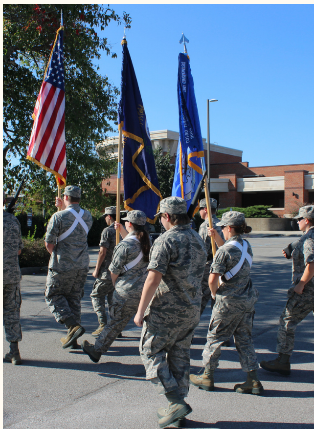
KY 2002 Group Cadets prepare to lead the Homecoming Parade 15 Sept 2023