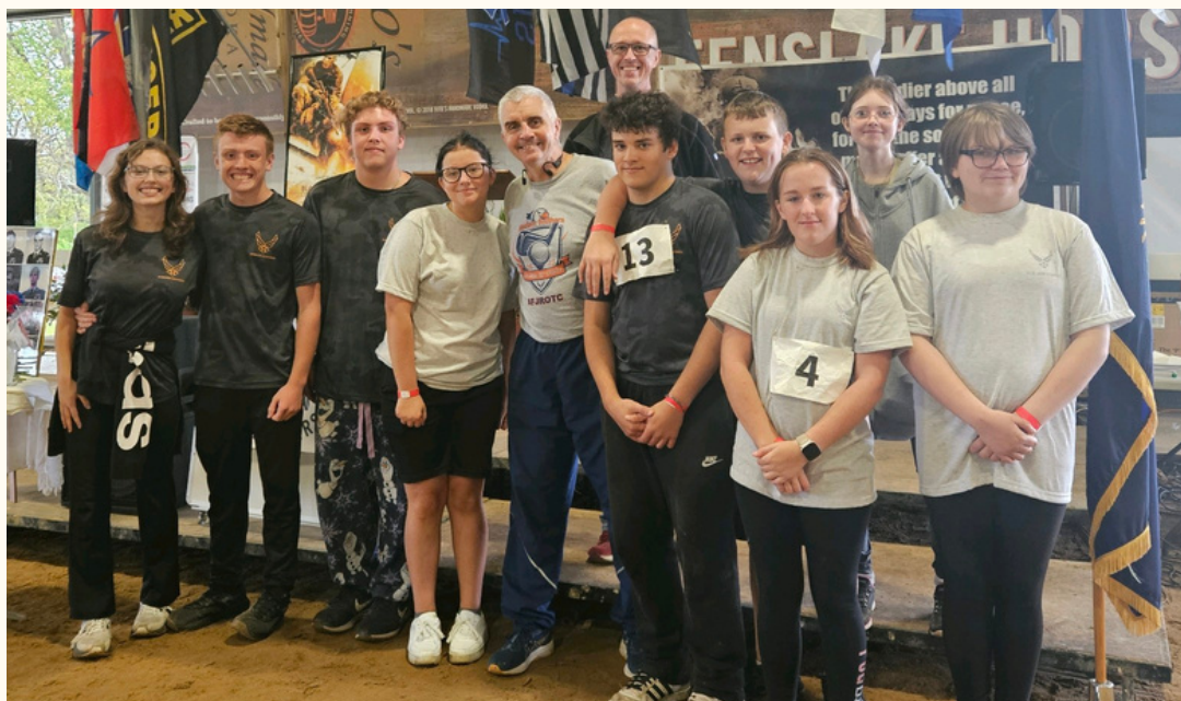
MSHS JROTC Raiders at Mogadishu Mile event in Georgetown, KY 14 Oct 2023

During the day, Aerospace Science and Leadership cadets work hard, studying subjects such as aircraft history, unmanned aircraft flight, and potential job opportunities after high school. But what do these dynamic young leaders do after the school day ends? For many of them, leadership development continues through the many AFJROTC after-school programs. These programs include the Group Color Guard Team, the Group Marksmanship Team, and the Group's competitive physical fitness team, also known as the Raiders, and, new for this year, the JROTC Leadership and Academic Bowl (JLAB). These activities give cadets an opportunity to travel around the state and compete with other schools while developing confidence and teamwork skills.