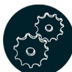
Manufacturing and Product Development