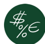
Business and Finance