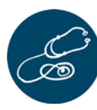
Health Science and Medical Technology