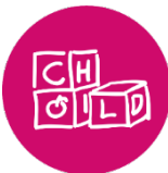
Education, Child Development and Family Services