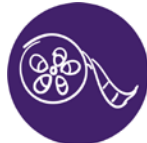
Arts, Media, and Entertainment