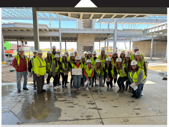
Heritage Staff Tour