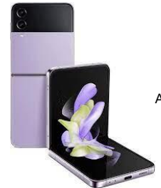
Flip 4- Amazon

The Flip 4 works just like a normal phone when opened with little to no problems to occur. Some would say the middle where the phone folds would be a problem as at certain angles you can really