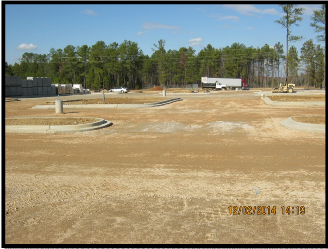
Grading / Curb and Gutter