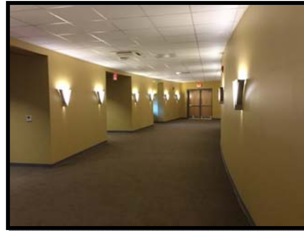
New Auditorium Vestibule