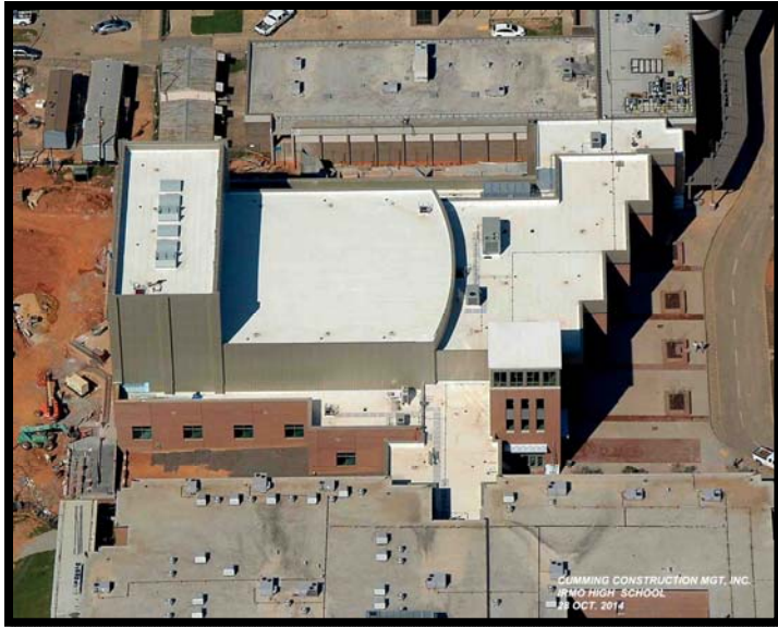
New Auditorium along St. Andrews