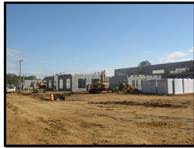
Classroom Wing Masonry