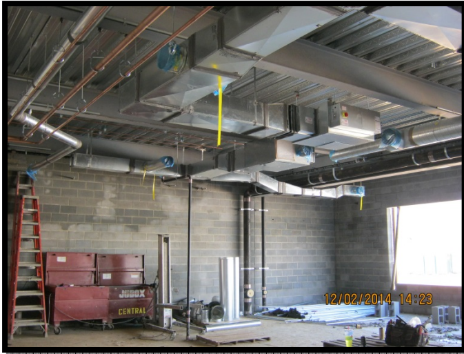
HVAC Duct and Plumbing