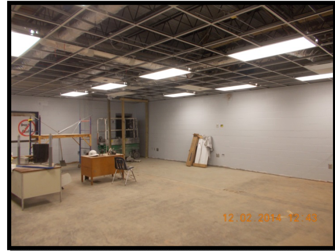
New Classroom Space