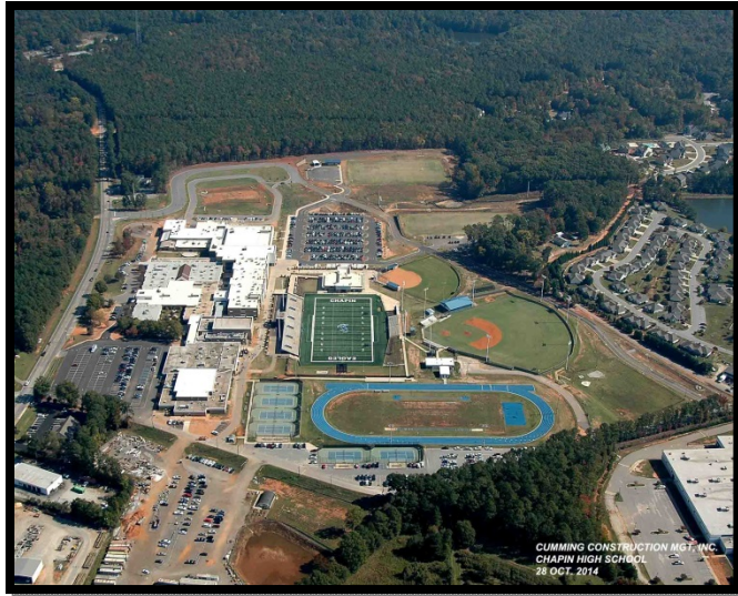
Site Aerial along Columbia Avenue