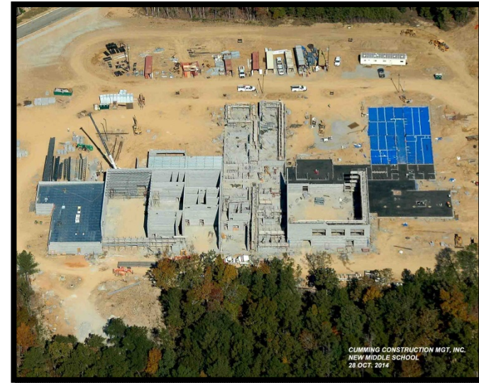
Slabs and Decking