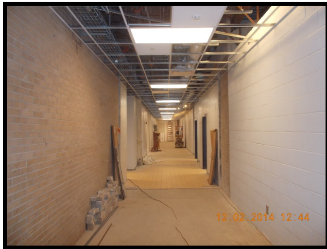
Hallway to New Cafeteria