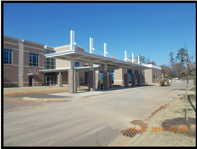
Parent Drop Off Canopy