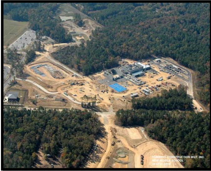
New Middle School Site from Broad River Road