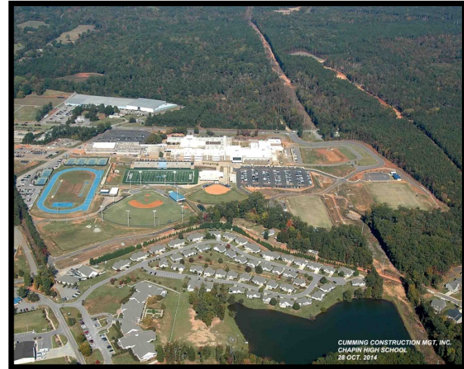
Site Aerial towards Columbia Avenue