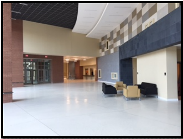
New Auditorium Main Lobby