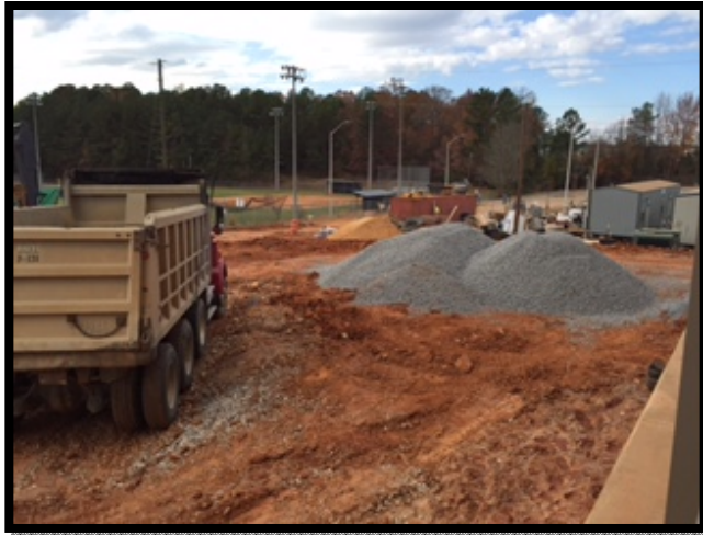
Loading Dock Area