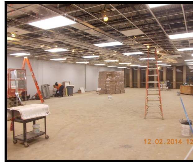
New Display Classroom