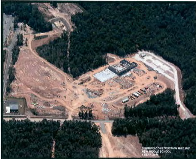
New Middle School Site from Broad River Road