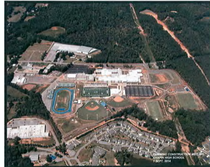
Site Aerial towards Columbia Avenue