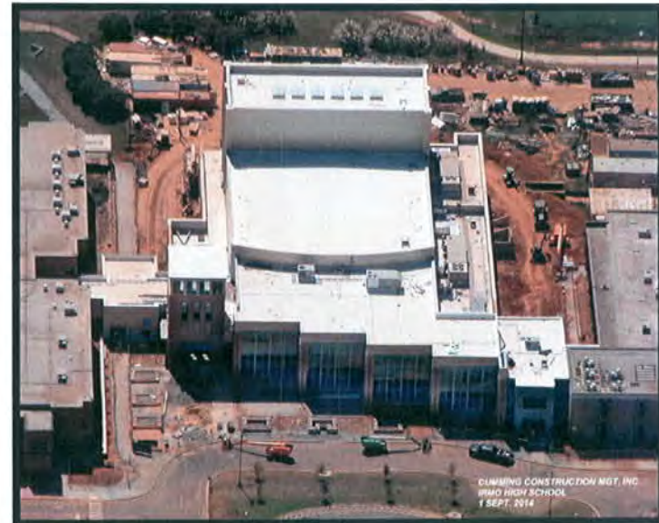
New Auditorium away from St. Andrews