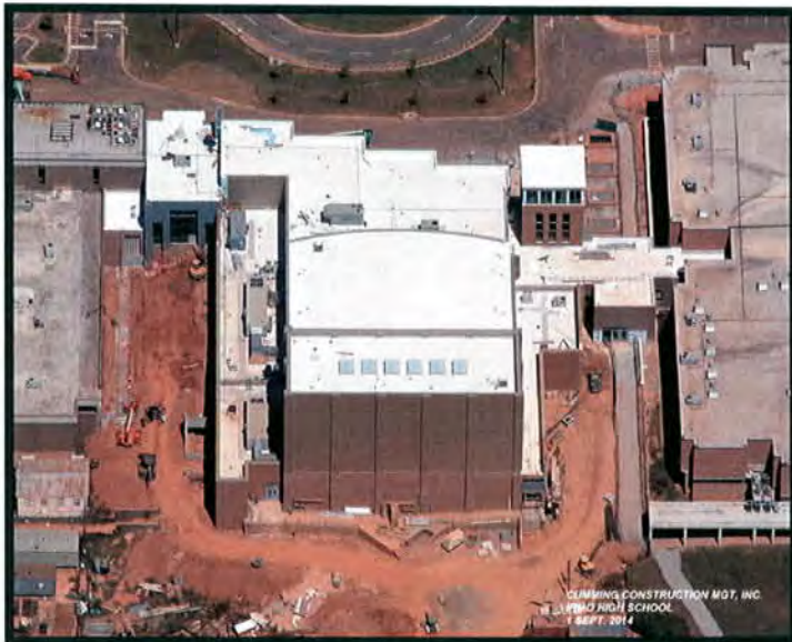
New Auditorium towards St. Andrews