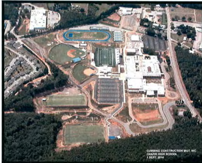
Site Aerial along Columbia Avenue