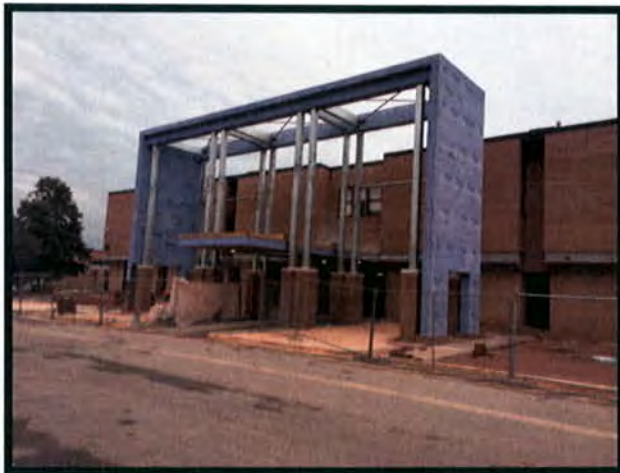
New Main Entrance