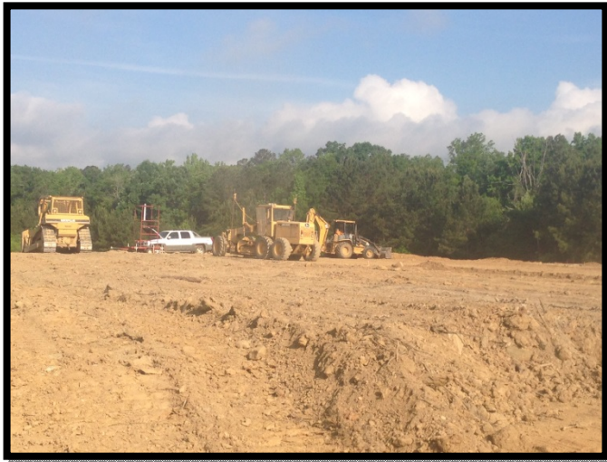
Soccer Field Grading