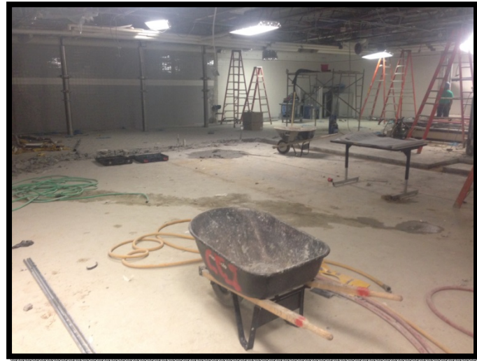
Existing Building Demo