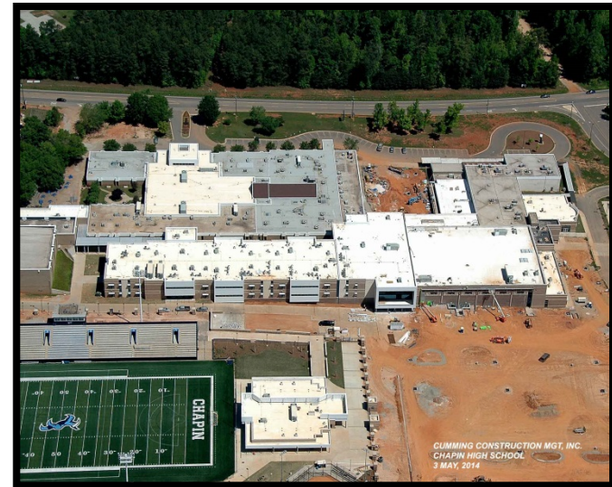
Site Aerial towards Columbia Avenue