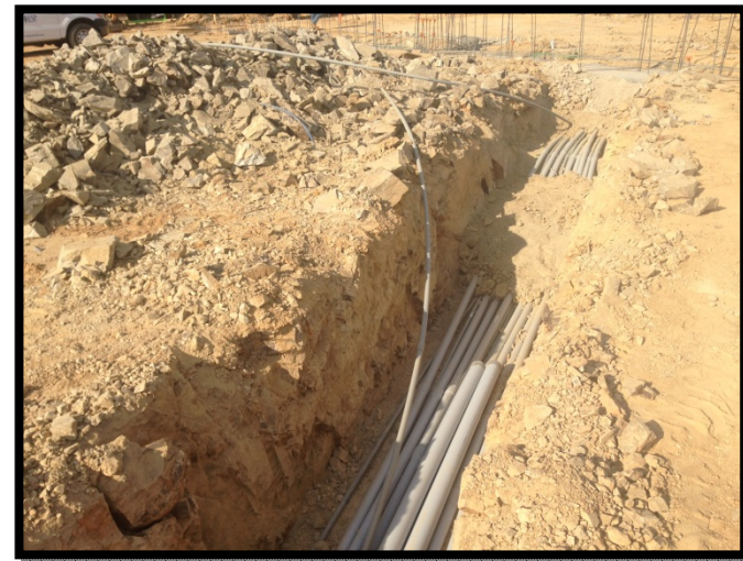
Electrical Rough In