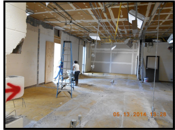
Renovation at CATE