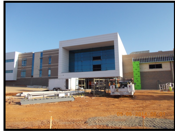
Exterior Gym Lobby