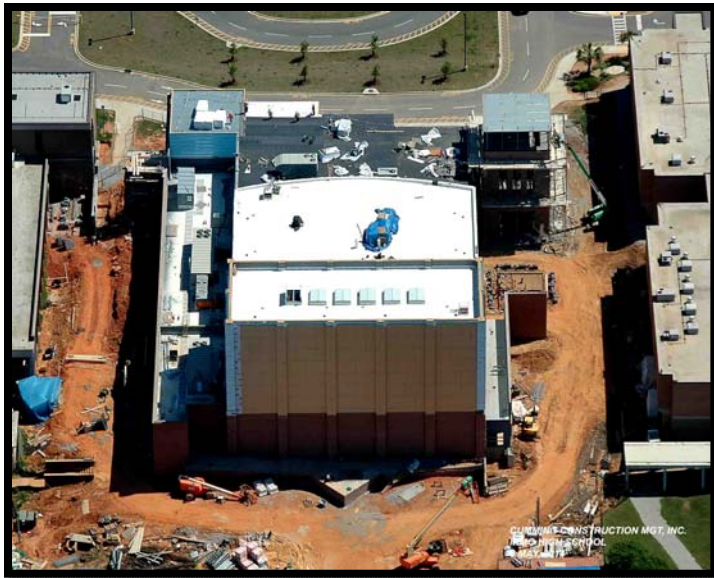
New Auditorium towards St. Andrews