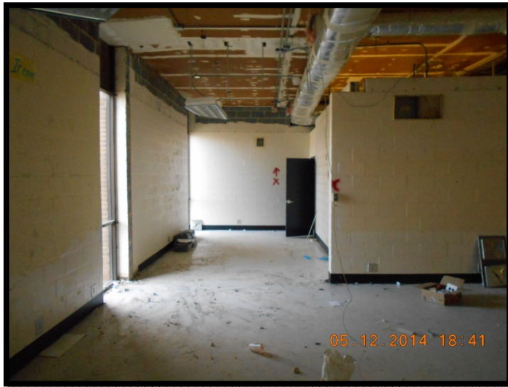
Renovation at CATE