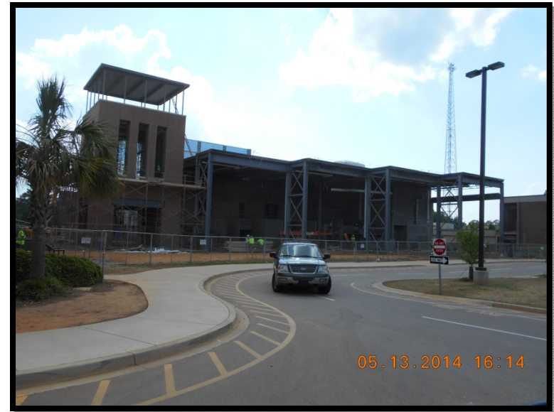
Front of New Auditorium