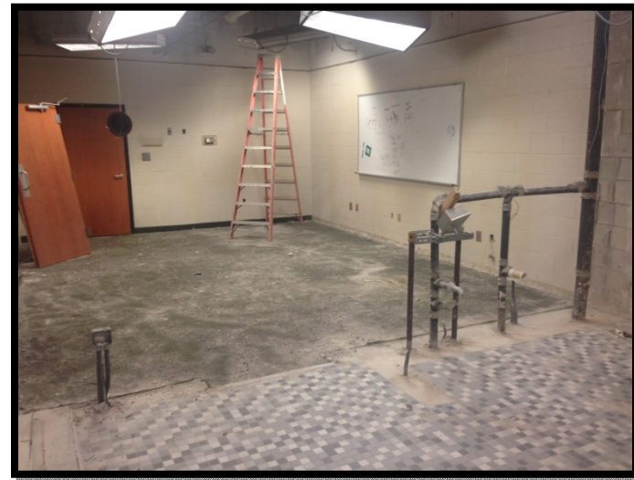
Existing Building Renovation