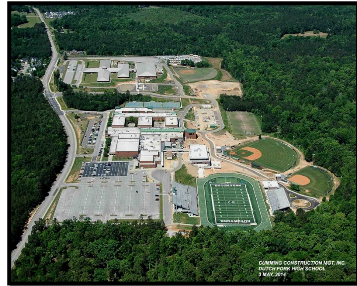
DFHS Aerial towards DFMS