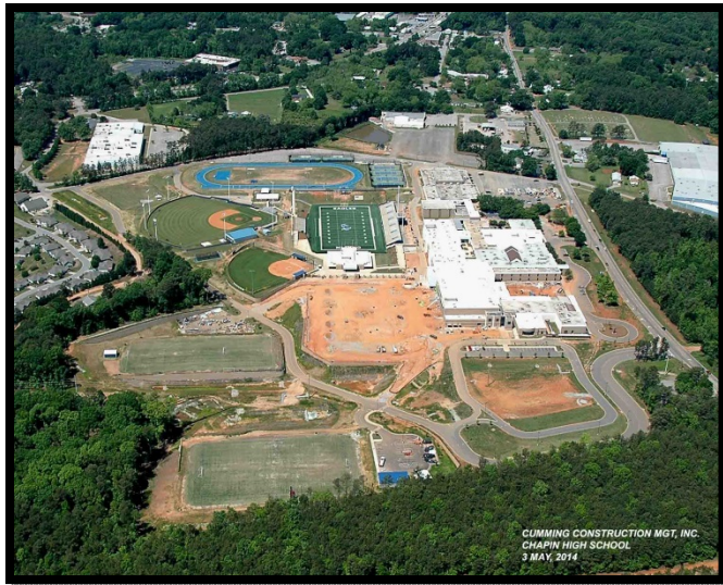
Site Aerial along Columbia Avenue