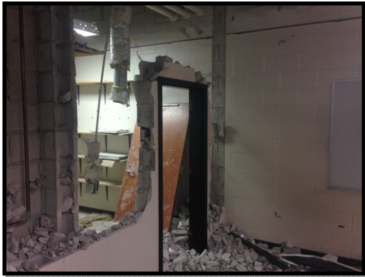
Existing Building Demo