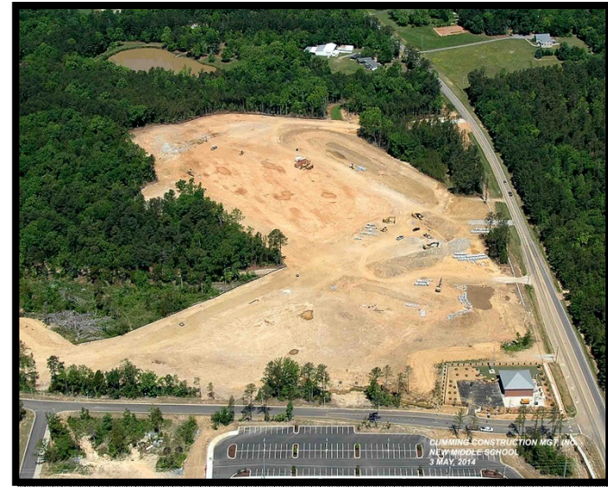
New Middle School Site from Spring Hill High School