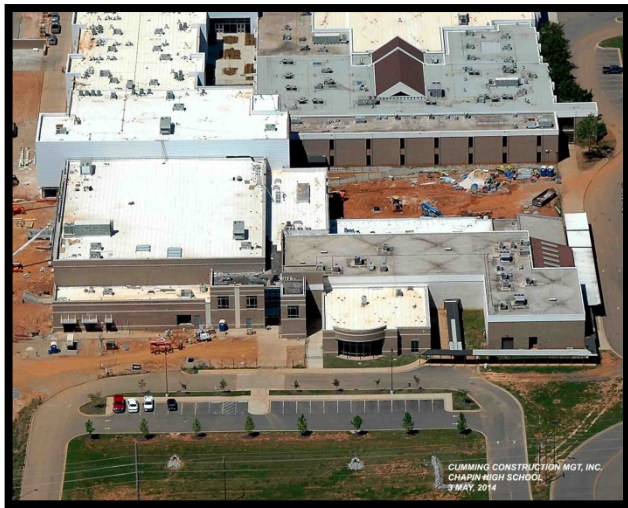
New Gym and Strings