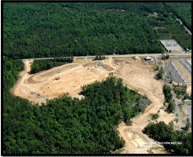
New Middle School Site towards Broad River Road