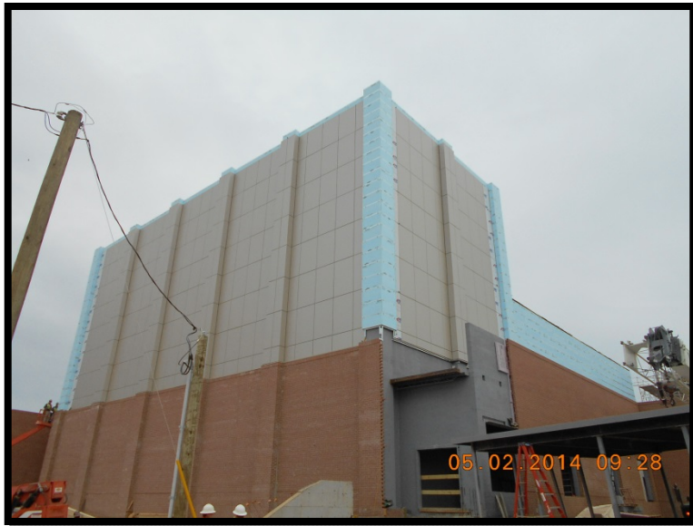
New Auditorium Metal Panels