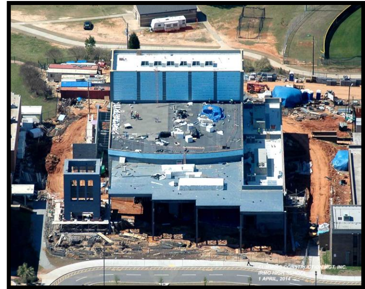
New Auditorium away from St. Andrews