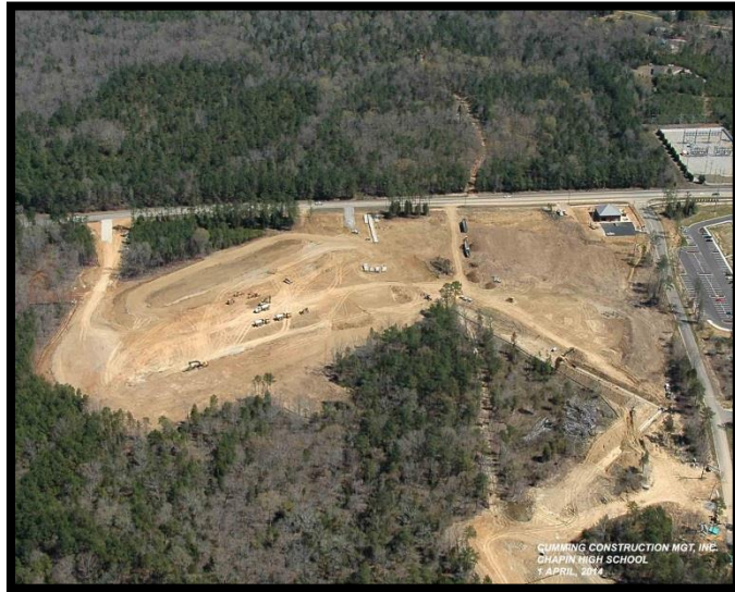
New Middle School Site towards Broad River Road