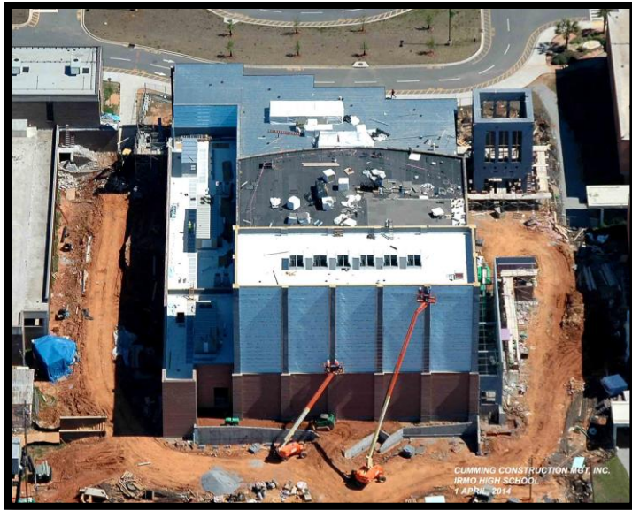
New Auditorium towards St. Andrews