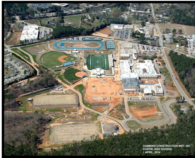
Site Aerial along Columbia Avenue