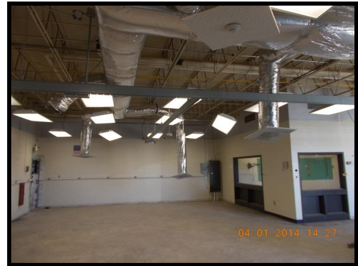
Demolition at Existing Gymnasium