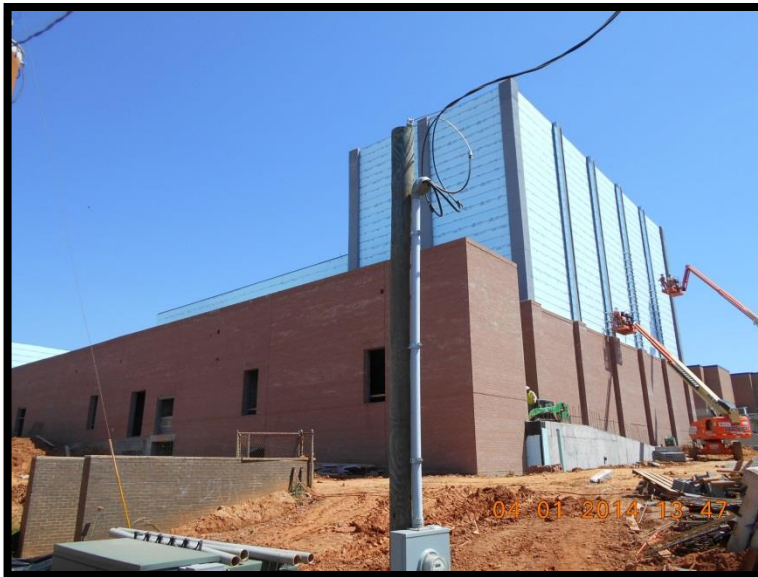
New Auditorium Metal Panel Prep