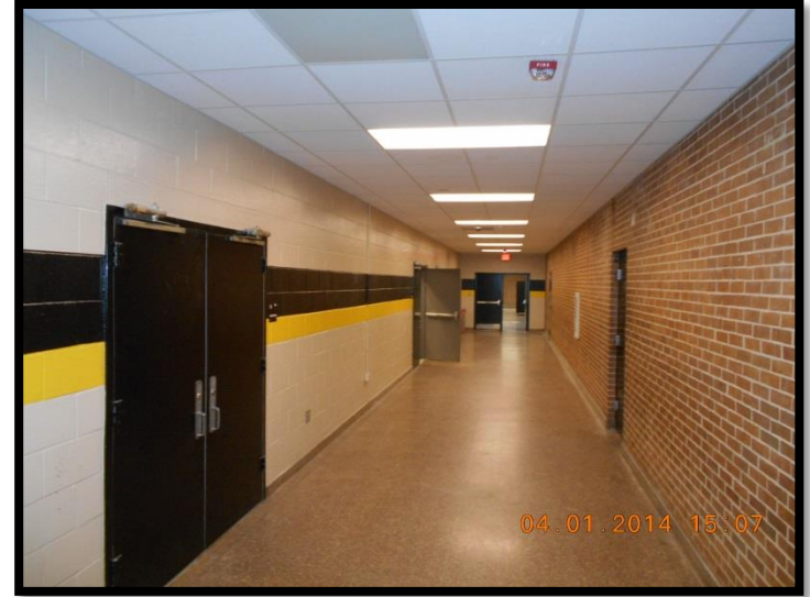
Area 6 Renovation