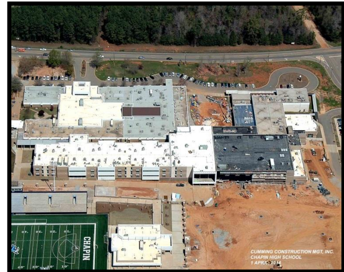
Site Aerial towards Columbia Avenue