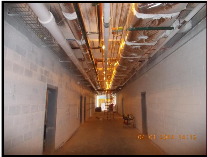
Lower Level of New Gymnasium