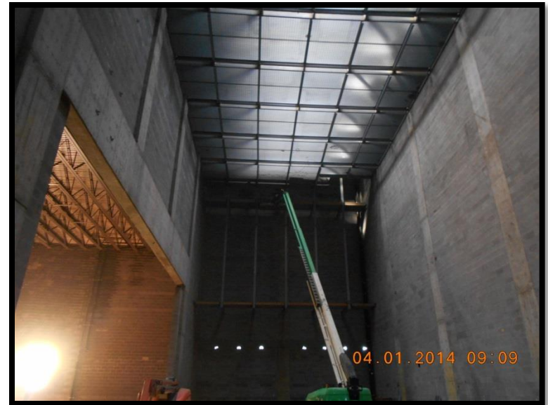
New Auditorium Stage Area