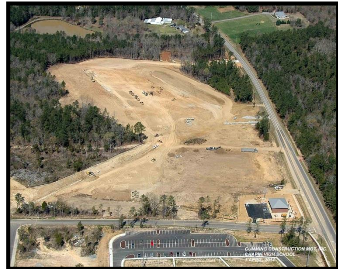
New Middle School Site from Spring Hill High School