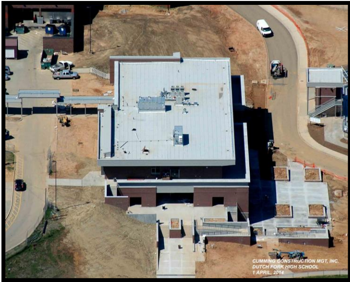
Health Science Aerial