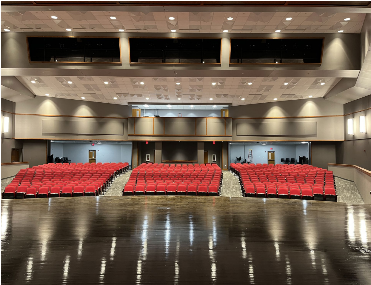
New Wheeler Auditorium