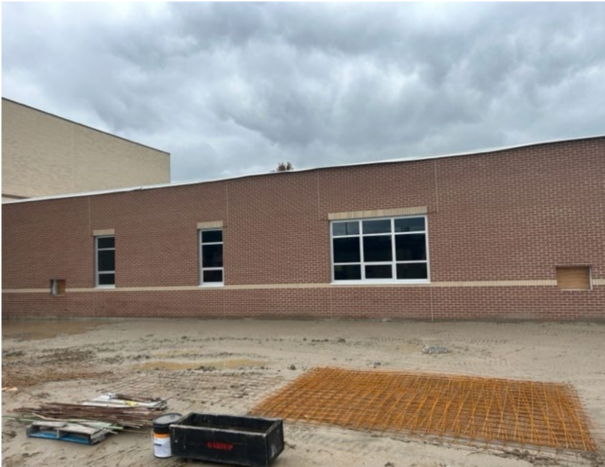
New Media Center Addition