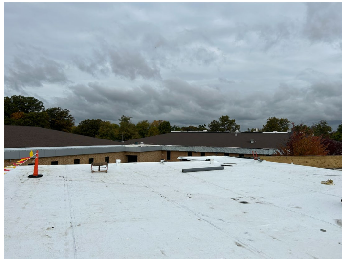
New Roof Installation