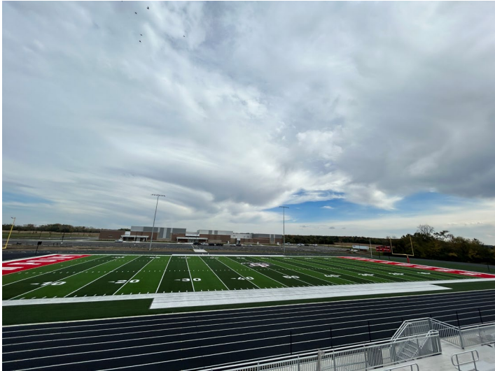
Football Field and Track