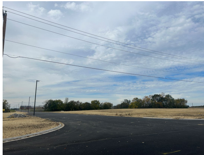
South Entrance Road