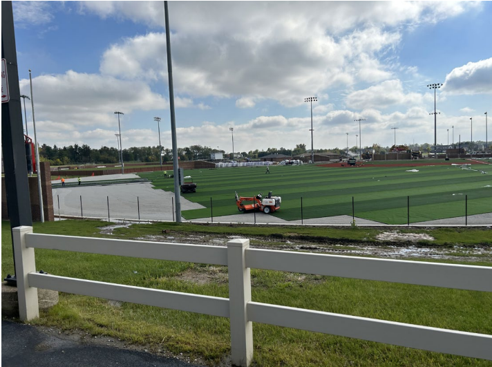
Varsity Baseball Field Turf Installation