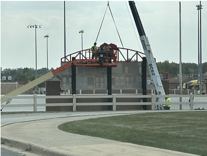
Varsity Baseball Field Scoreboard