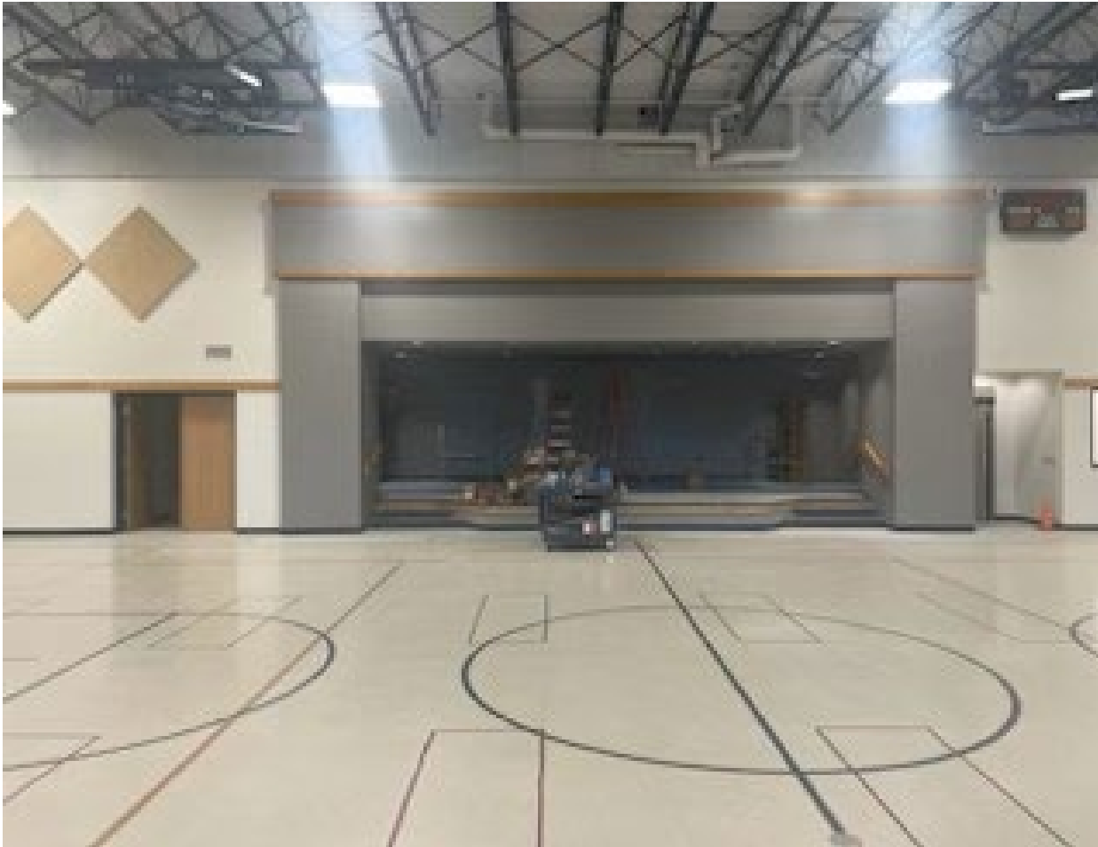
New Stage in Gymnasium