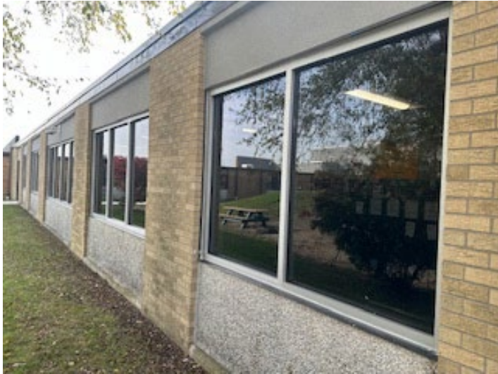
New Courtyard Windows