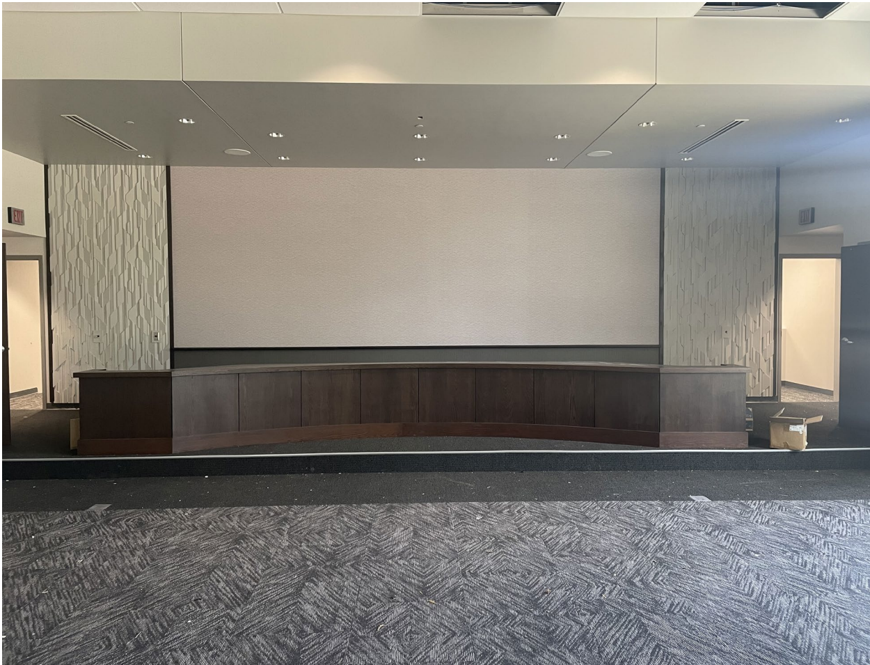
Board Room Table