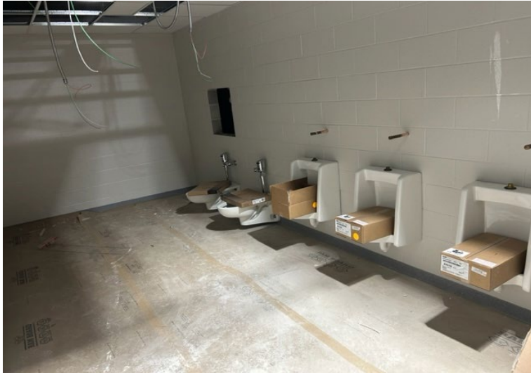
Unit B Restrooms