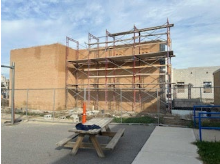
Kitchen Addition South Wall