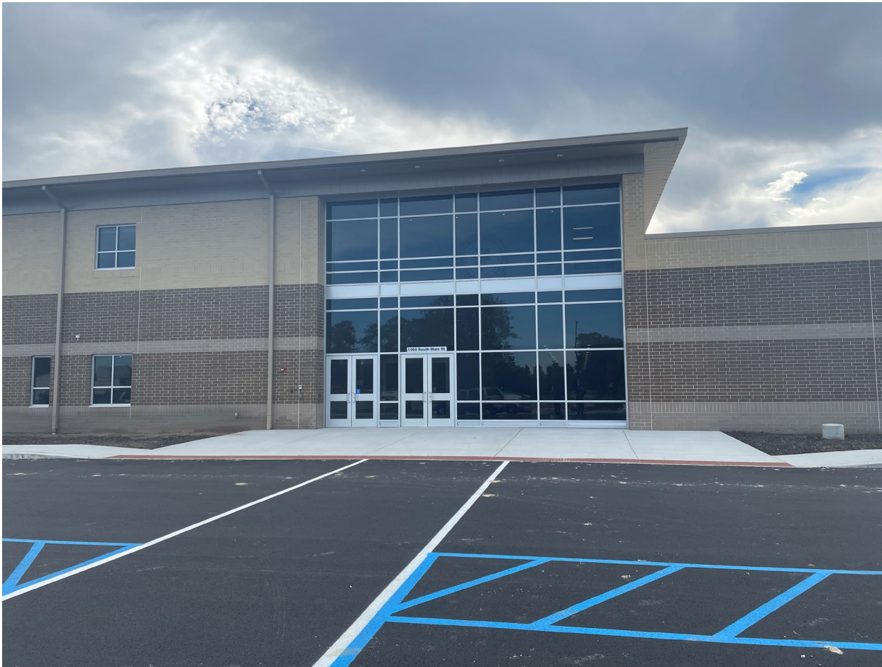
Front Entrance of New Admin Building