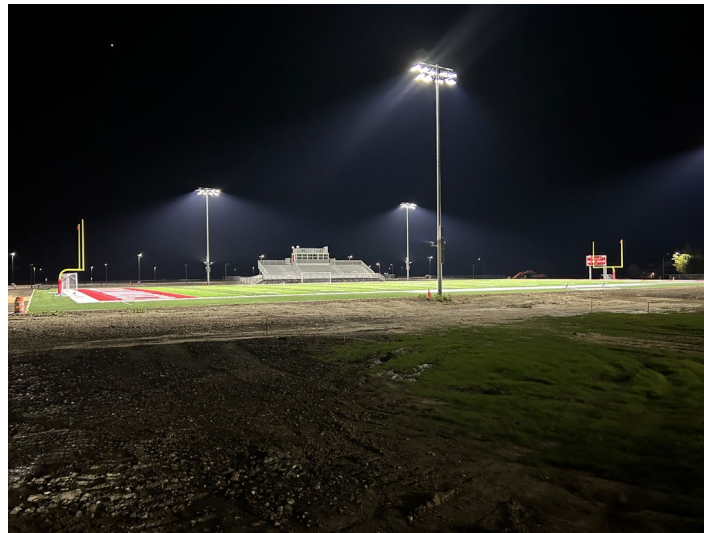
New Multipurpose Field Site Lighting