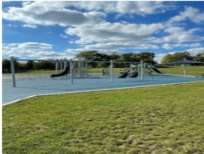
New Playground Soft Surface