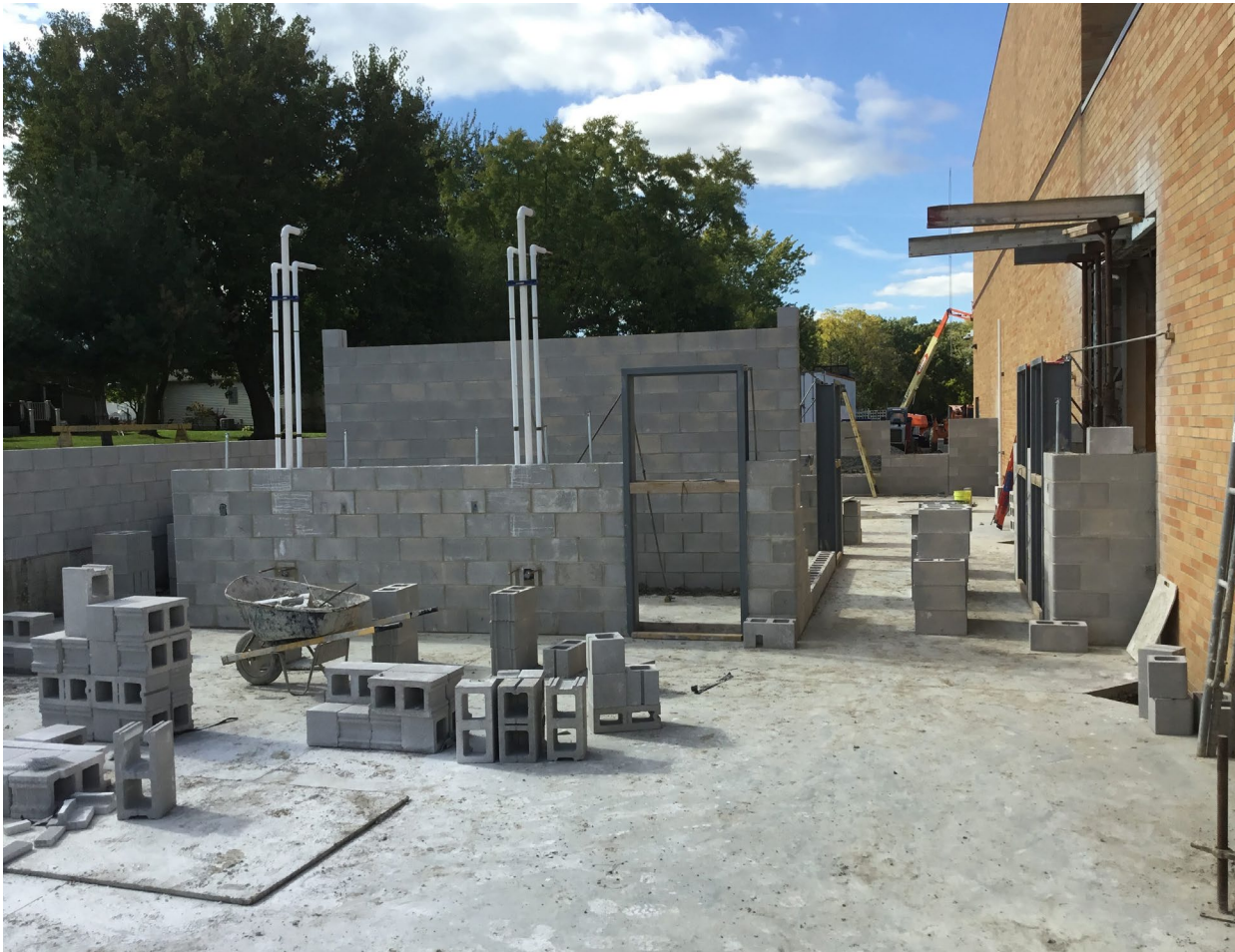
New Classroom Addition