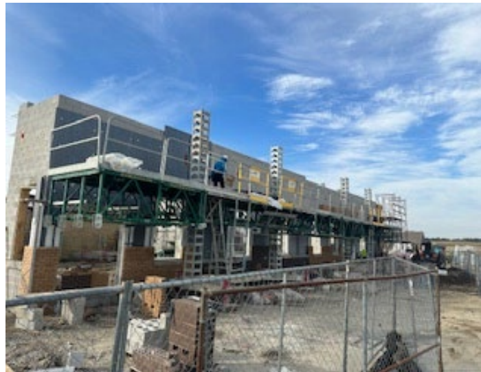
Kitchen Addition North Wall