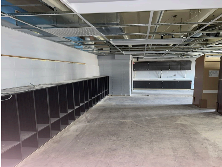
New Kindergarten Classroom