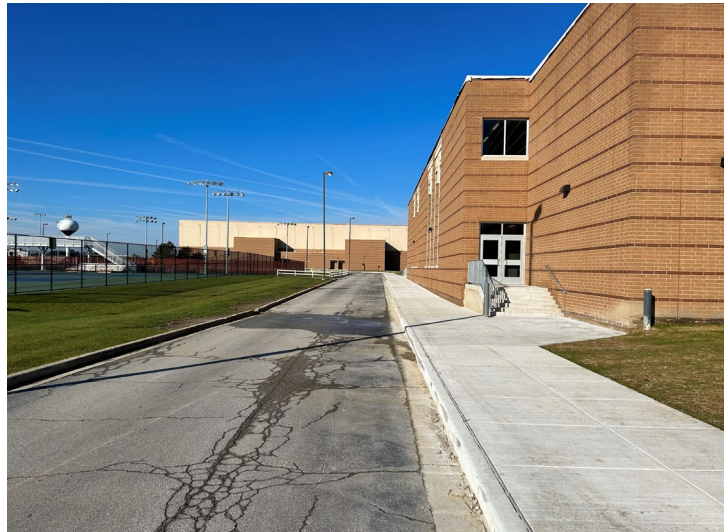
Unit A Sidewalks