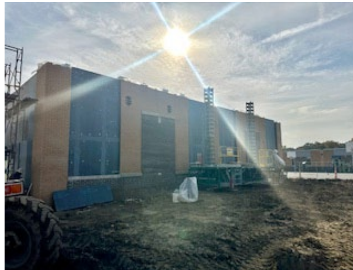
Kitchen Addition West Wall