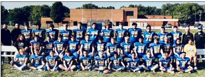
8th Grade Football