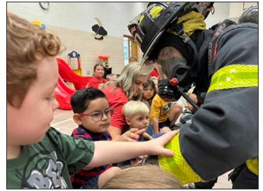
Fire gear, fire truck on site for fire safety month