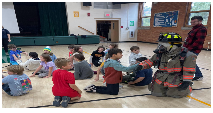
FIRE PREVENTION SAFETY DAY!