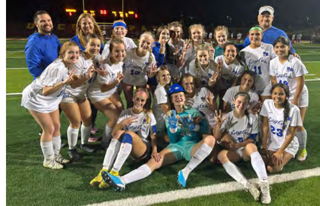
Barbers Hill High School girls soccer team made the first regional semifinal appearance in district history.

The Barbers Hill girls golf team captured the district tournament title.