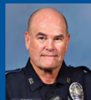
Britt Wendell Police Department