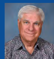
Charles McManus HS