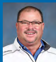
Richard Miles HS