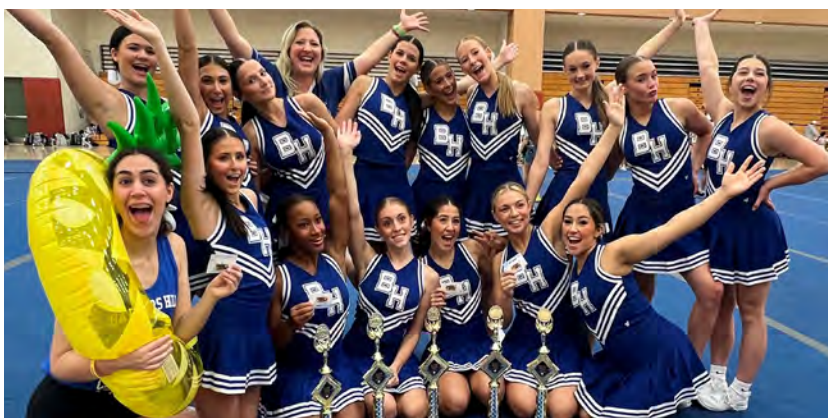
The Barbers Hill High School varsity cheerleaders attended UCA camp at the University of Texas in Austin and did exceptionally well, bringing home a host of awards and accolades.

I would have preferred to recognize more of our achievements in this space rather than sounding the alarm, but our district's health is at stake. The state's term for this new erosion of local control is "compression." I describe it as much like a tourniquet. There are scenarios where tourniquets save lives, but in our instance, it has the potential to do grave harm. If our board chooses to have a VATRE at our August board meeting, I and all Barbers Hill leaders legally will not be able to advocate which is the reason I am using this message to emphasize the importance of our VATRE (if called) passing. We need our money to stay here where our students and staff can continue to maintain the finest school district in Texas!