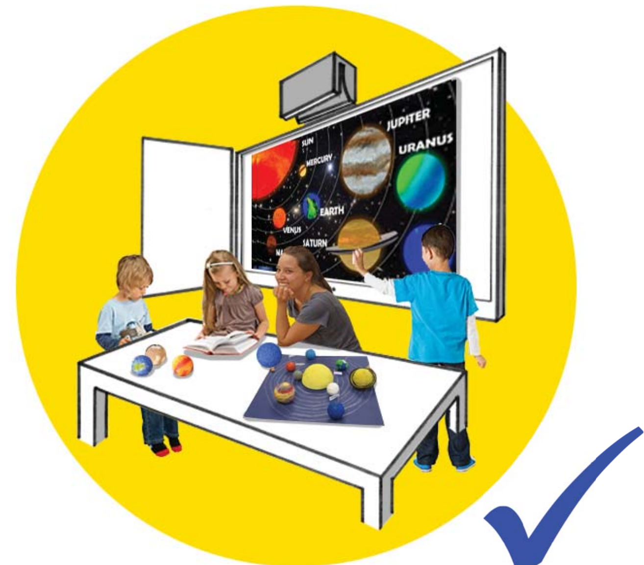
How Students Learn