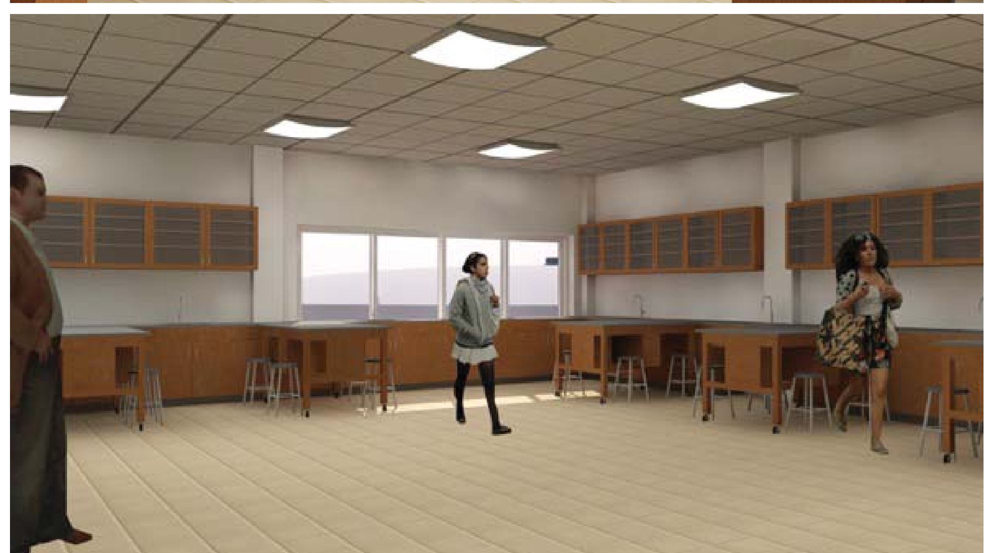
Improved Science Labs