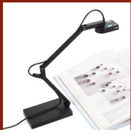
USB Document Cameras