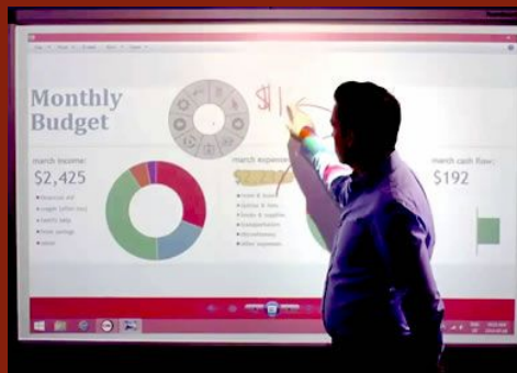
70" Interactive Touchscreens