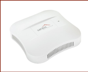
Wireless Access Points