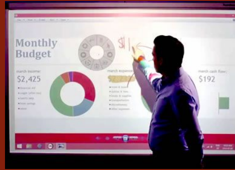
70" Interactive Touchscreens