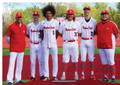
Baseball seniors at Senior Night