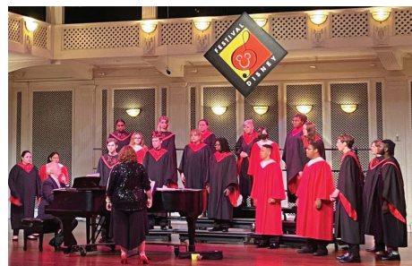
Choir performing at Festival Disney in Orlando, FL