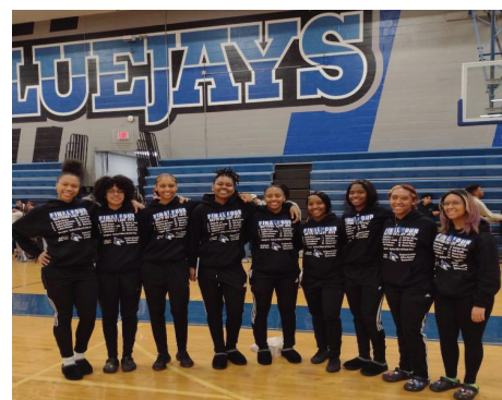
Lady Jays at State Championship practice