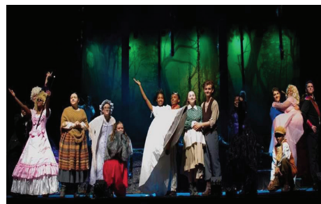
Theatre Department "Into the Woods" performance