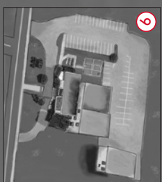
Map is based upon rendering created by Emno Fontaine '12