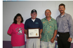
Elk Neck Elementary School