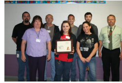
Rising Sun High School

Cecilton Elementary, North East Elementary, Calvert Elementary, Cecil Manor Elementary, Cherry Hill Middle, Rising Sun High, Rising Sun Middle, and Bay View Elementary Schools have all received two Superior ratings.