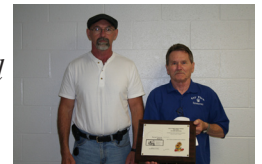
Bay View School