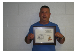
The Providence School