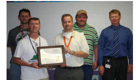
Rising Sun Middle School