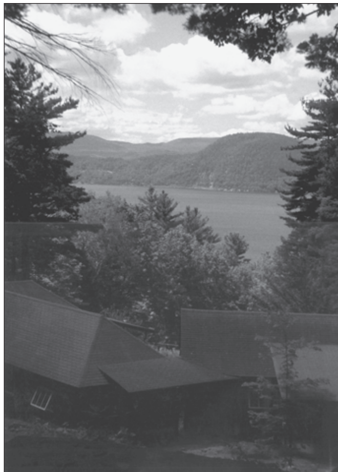
"The view from the office porch is beautiful as always."

As we start a new decade, the view from the office porch is beautiful as always, and the camp's good financial health makes us all rock more comfortably. Our sincere thanks to all the loyal friends in the Pasquaney family who helped to make it that way.