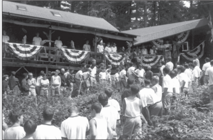
Campers, counsellors, and guests gather for the dedication ceremony.