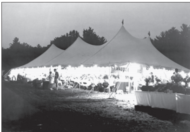
"The decade also saw many celebrations and commemorative events. Most prominent was the Centennial celebration, which drew over 700 people to the hillside."