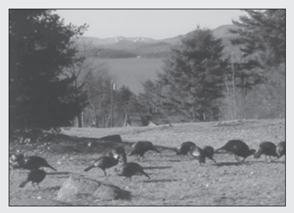
Wild turkeys enjoy a meal in the field below the infirmary early this spring.