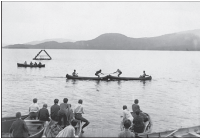
A Pasquaney canoe tilt in the late 1890s.