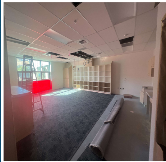
2 nd Floor Classroom