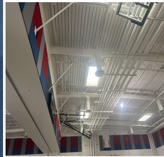
Acoustical Wall Panels