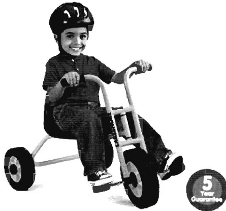
pre-k - 2nd grade / 4 yrs. - 7 yrs.