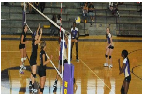
North Kansas City High School Parent and Student Handbook 19