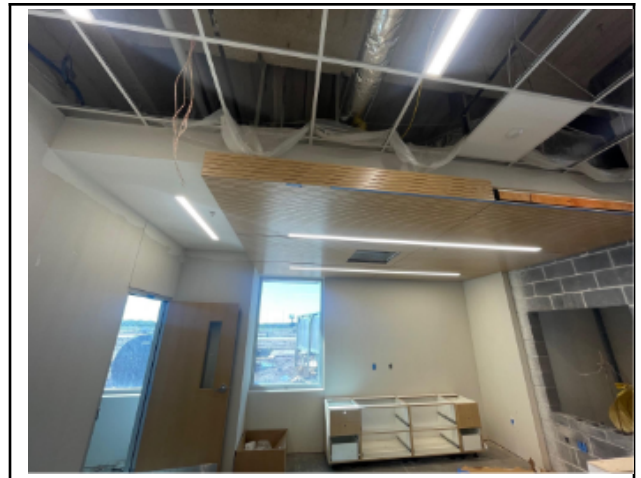
Area C Main Reception