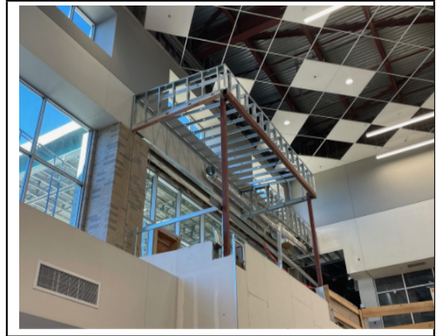
Art Balcony Vestibule Framing