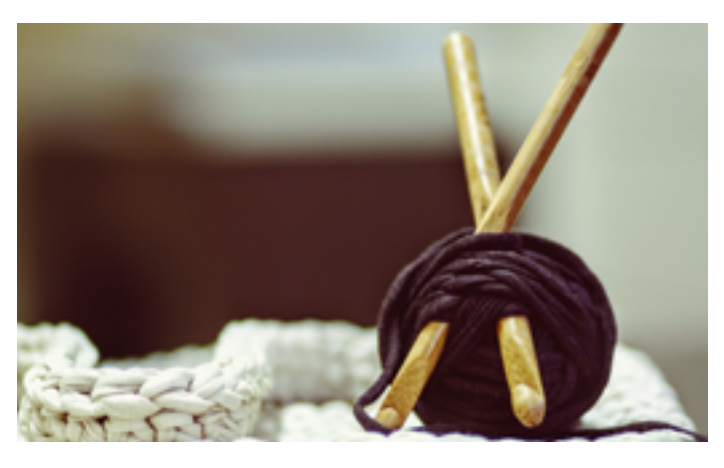
Knitting & Crochet Club

The Club is looking for an interested student or group of students to prepare a playlist and play it during lunch break.