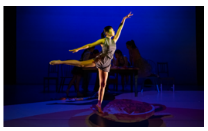
Dance - Ballet Foundations

Get ready to meet fellow word enthusiasts, exercise your brain, and have a blast with us as we unravel the mysteries of words and clues. All skill levels are welcome, so come join the crossword excitement!