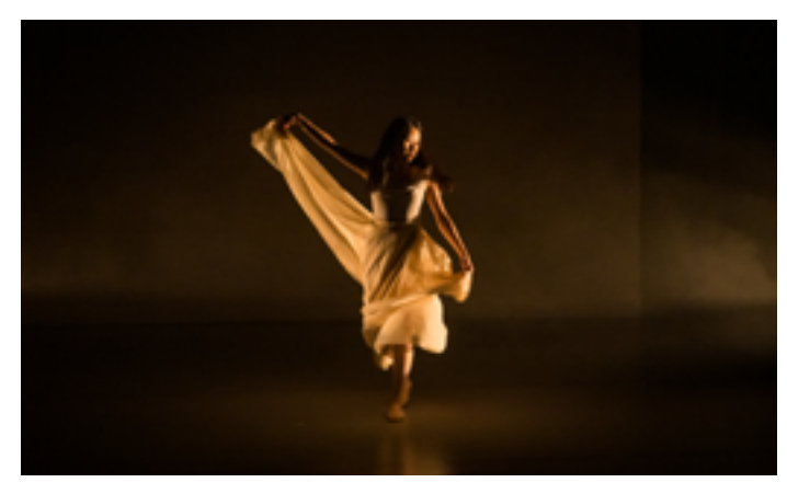
Dance - Jazz, Lyrical & Contemporary Foundations

A beginner-friendly workshop exploring hip-hop dance basics, including isolations, grooves, and foundational steps. Students in this course will have the exciting opportunity to perform in the GAME ON Show, a Physical Theatre and Dance performance taking place at the Collingwood Theatre from January 27 to 31, 2025.