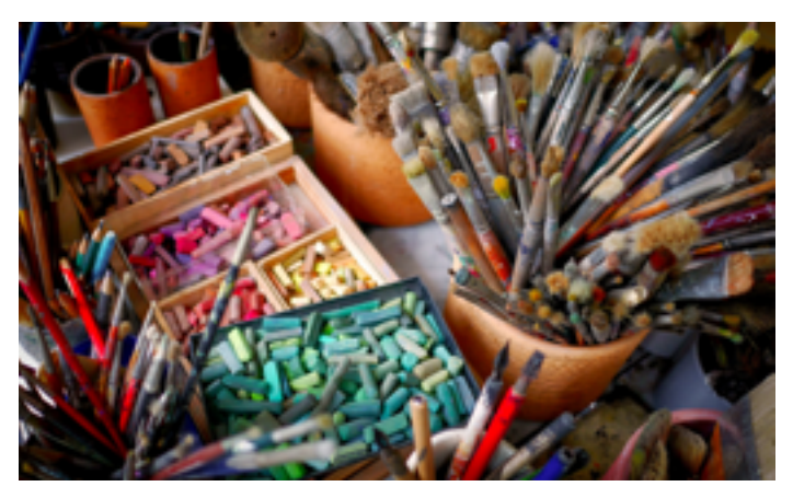
Interdisciplinary and Transdisciplinary Research & Art Making

A student-run physical publication featuring student portfolios, works, clubs, and more! You can read our first publication by visiting the Morven Library. We meet through Discord calls are there are no fixed meeting times.