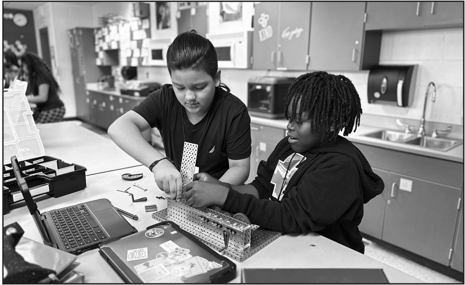
Garfield 6th graders in the Project Lead the Way Robotics class exhibit our Vision of a Lakewood Ranger competencies of collaboration and critical thinking as they work on simple machine designs.