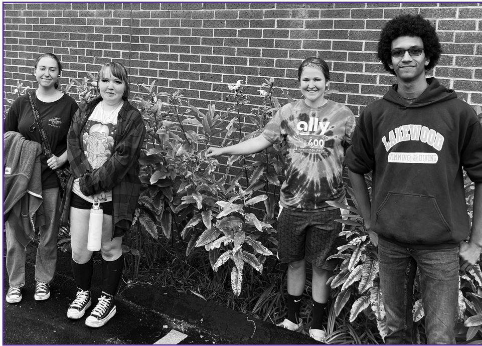
Students from Lakewood High School's Horticulture classes recently completed a community service project helping Beck Center for the Arts spruce up its grounds.

Last month, students from the Lakewood High School Horticulture class participated in what has become an annual community service project for students in Shannon Snare's class - doing grounds cleanup for Beck Center for the Arts. The students volunteered three hours on a September Sunday morning to straighten up some of the Beck gardens and trim the hanging vines and branches on the eastern edge of the large parking lot. The goal was to neaten up the outside in time for opening weekend of the 90th season at Beck Center.