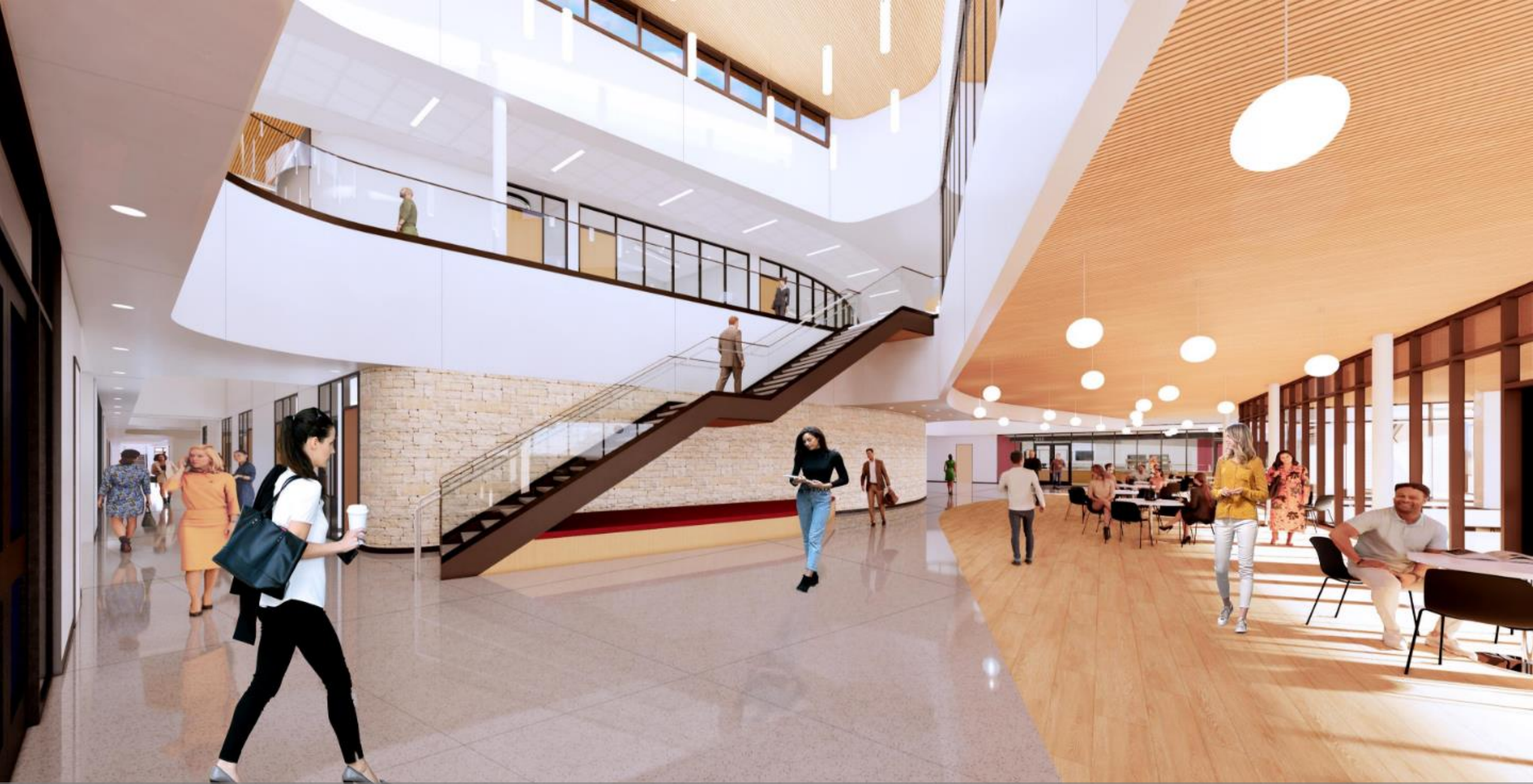
1 st Floor Primary Entry