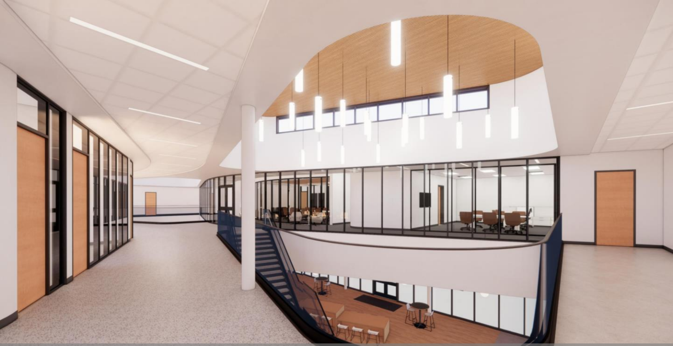
2 nd Floor above Primary Entry