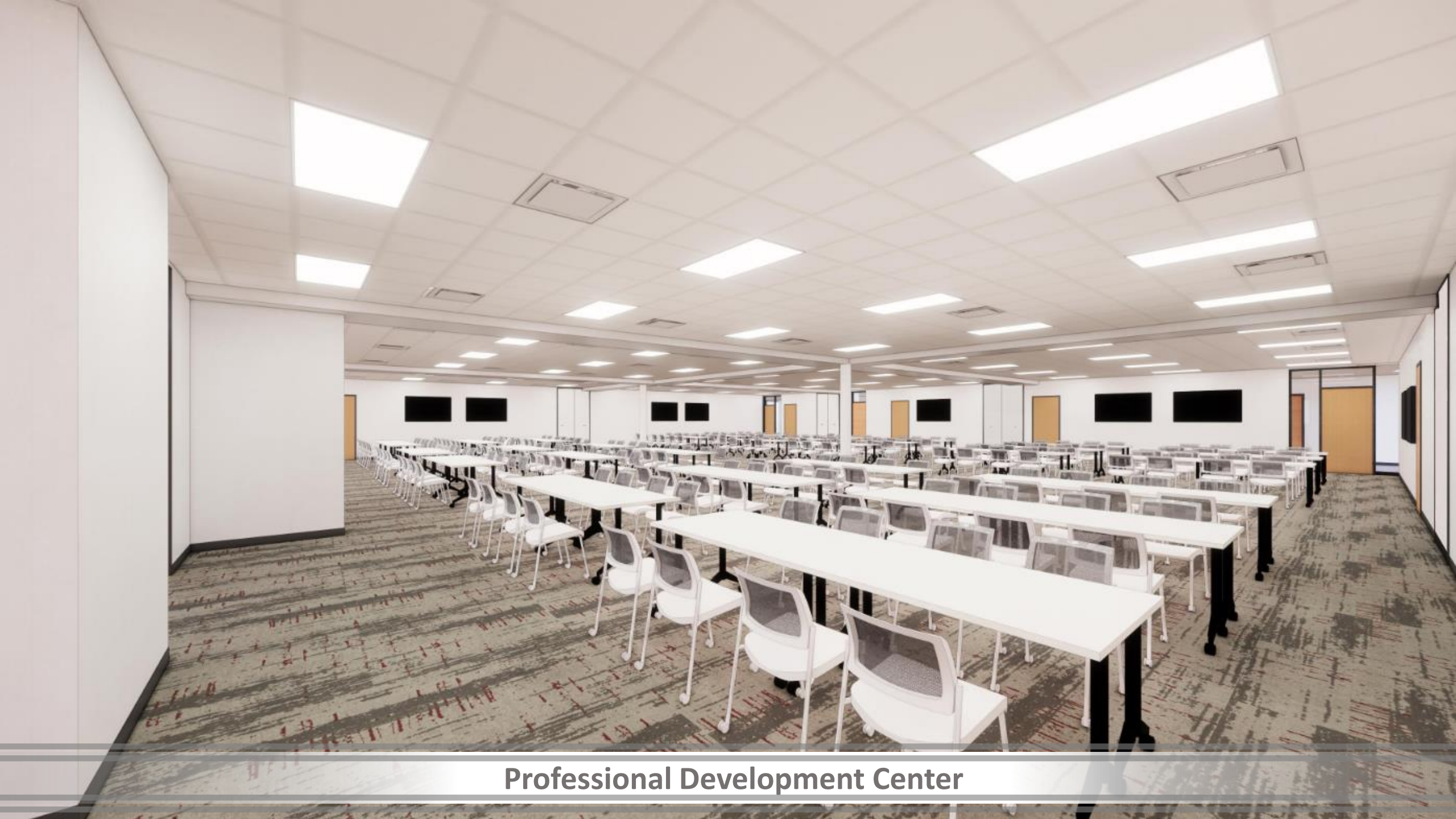
Professional Development Center