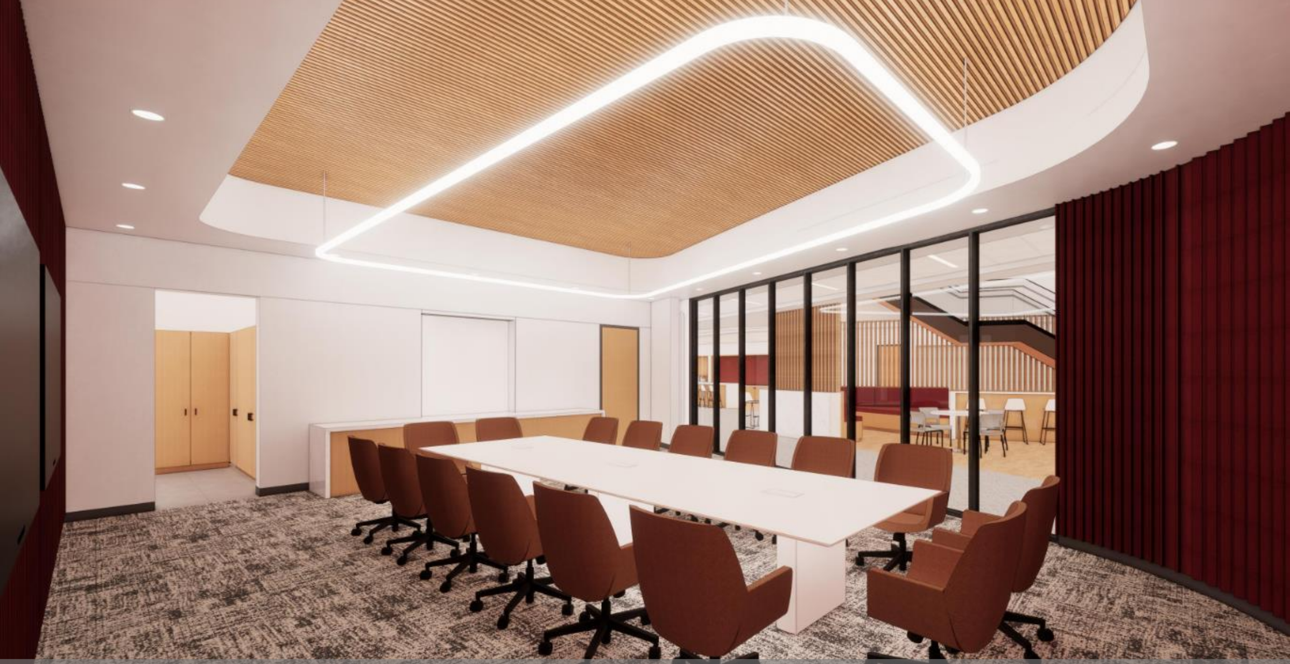
Board Conference Room