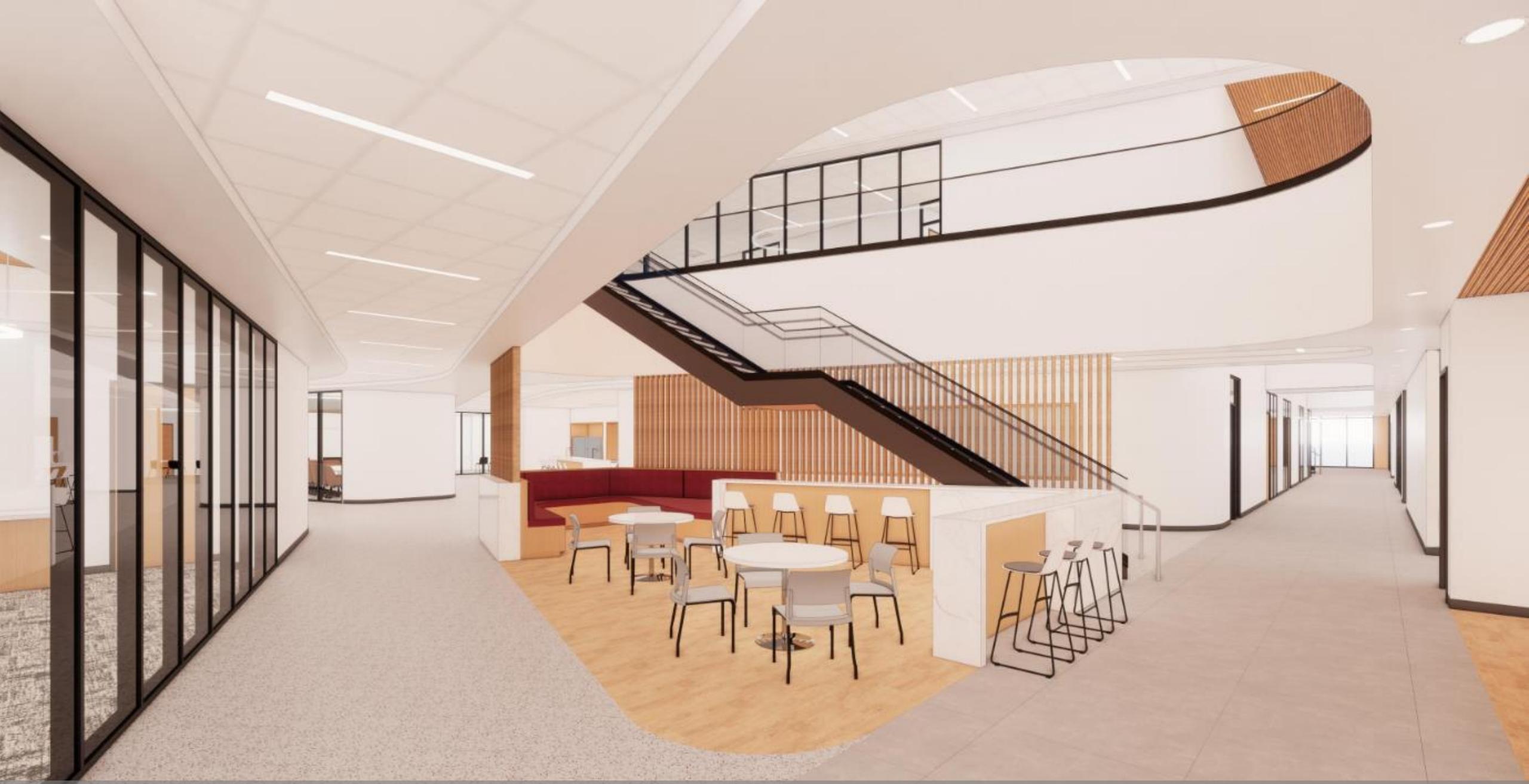
1 st Floor Middle Area