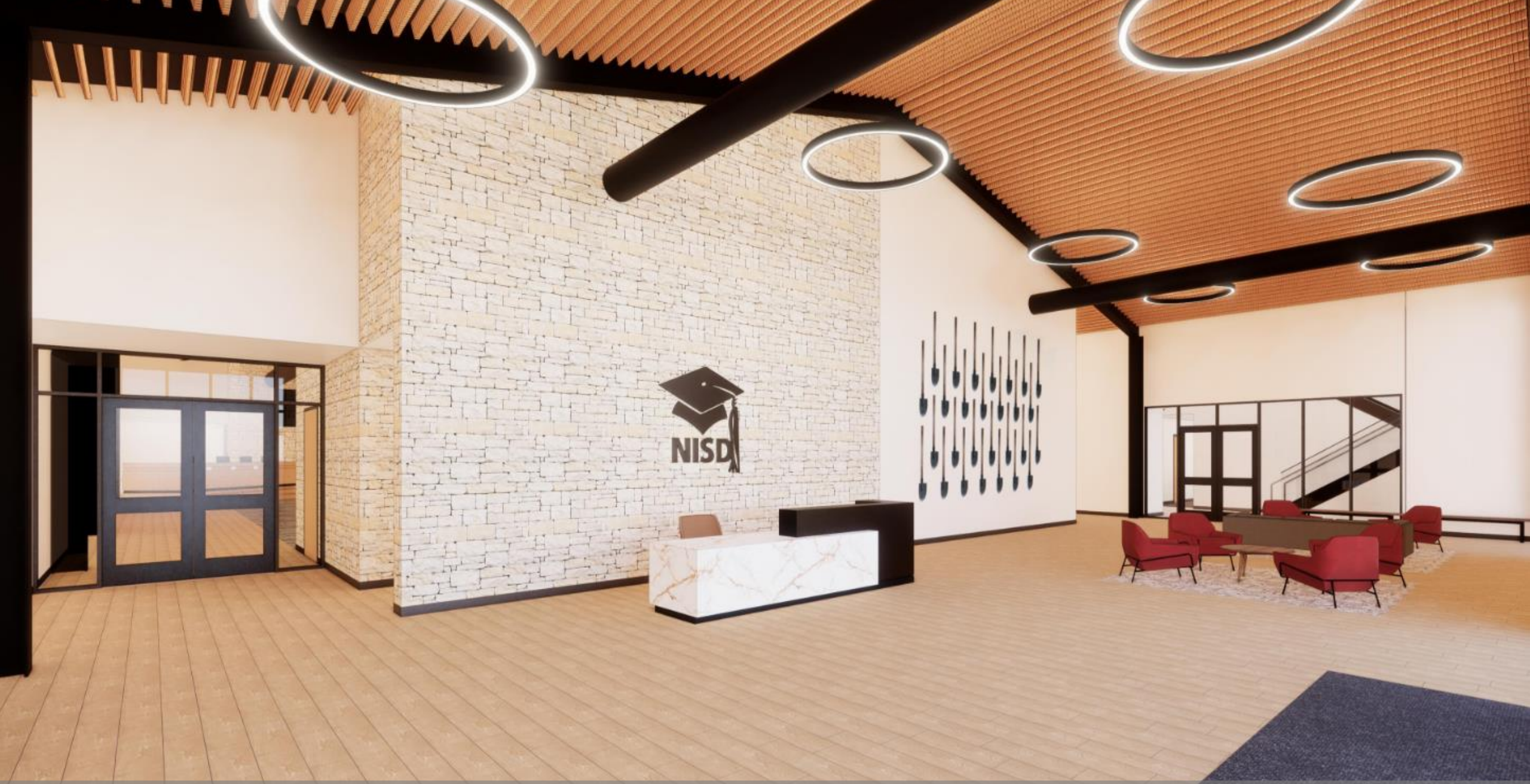
1 st Floor Boardroom Entry