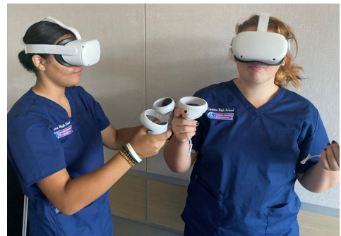
VR Medical Training

Seniors receive hybrid, online, and in-person CPR training. Many of them are excited for the new skill to add to their resume and to start applying entry-level jobs in the healthcare industry.