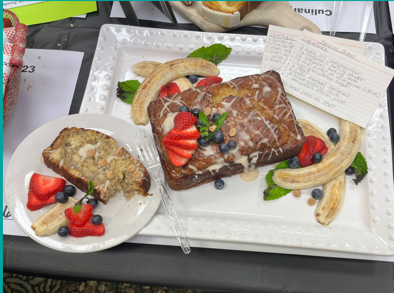
Patty Culb, Banana Bread