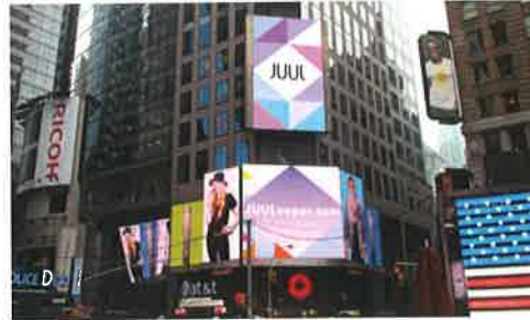
JUUL billboard in Times Square, New York City, 2015. https://www.spencer-pederson.com/work-1/2017/2/23/juul-go-to-market

When JUUL was first launched in 2015, the company used colorful, eye-catching designs and youth-oriented imagery and themes, such as young people dancing and using JUUL. JUUL’s original marketing campaign included billboards, YouTube videos, advertising in Vice Magazine, launch parties and a sampling tour.