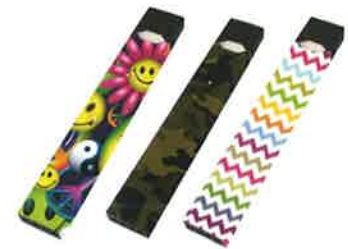
JUUL skins.

JUULpods come in five flavors: Cool Mint, Crème Brulee, Fruit Medley, Virginia Tobacco, Mango, as well as three additional limited edition flavors: Cool Cucumber, Classic Tobacco, and Classic Menthol. 1 Other companies manufacture “JUUL-compatible” pods in additional flavors; for example, the website Eonsmoke sells JUUL-compatible pods in Blueberry, Silky Strawberry, Mango, Cool Mint, Watermelon, Tobacco, and Caffé Latte flavors. 2 There are also companies that produce JUUL “wraps” or “skins,” decals that wrap around the JUUL device and allow JUUL users to customize their device with unique colors and patterns (and may be an appealing way for younger users to disguise their device).