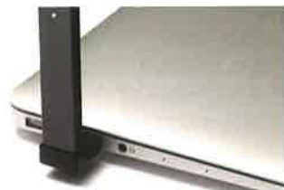
JUUL device charging in the USB port of a laptop.

JUUL Labs produces the JUUL device and JUULpods, which are inserted into the JUUL device. In appearance, the JUUL device looks quite similar to a USB flash drive, and can in fact be charged in the USB port of a computer. According to JUUL Labs, all JUULpods contain flavorings and 0.7mL e-liquid with 5% nicotine by weight, which they claim to be the equivalent amount of nicotine as a pack of cigarettes, or 200 puffs.