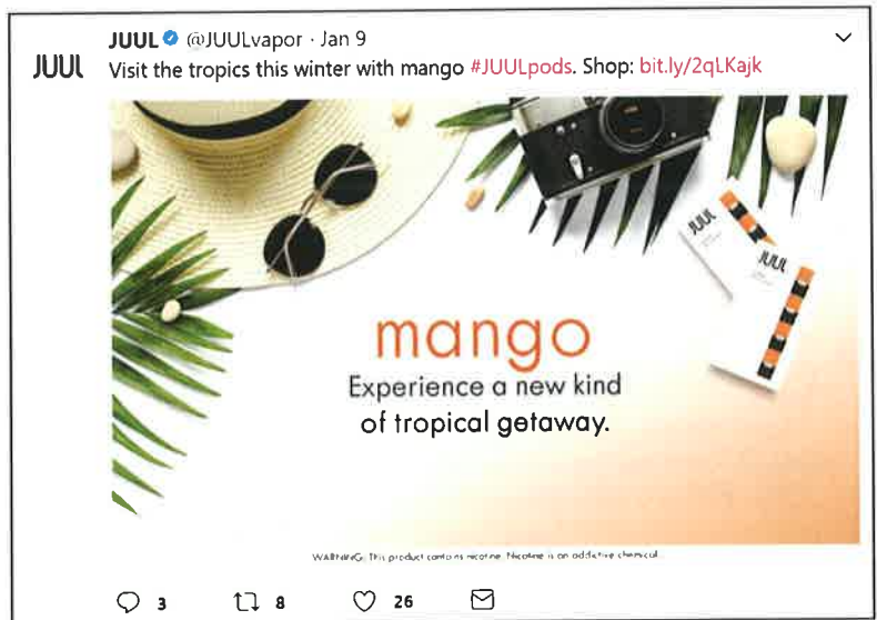
JUUL Twitter Post. January 9, 2018. https://twitter.com/JUULvapor/status/950890455499231235

JUUL devices and JUULpods are available for sale on JUUL’s website and other online retailers as well as in convenience stores, vape shops, and tobacco retailers. To access JUUL’s website, users must indicate that they are 21 or older by simply clicking on a button, but JUUL asserts that it uses stricter age verification processes for online purchases. FDA law prohibits sales of e-cigarettes to those under age 18 and some state and local laws have higher minimum age-of-sale laws. It is unclear where youth are obtaining JUUL products, but there have been anecdotes about purchasing them from social sources who are over age 18, online or in-person from retailers that are not in compliance with state or federal law, or from online resellers like ebay † and Craigslist that have no age verification. Though the up-front cost of the device is high (a JUUL starter kit, which includes the device, charger and 4 JUULpods, is $49.99 on the JUUL website), advocates have shared stories of kids pooling together money to share a device and sell “hits” from the device to recoup the cost.