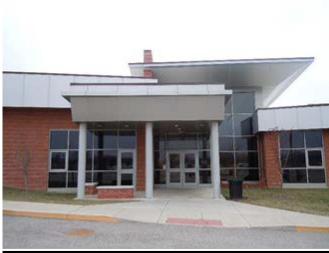
Lewis & Clark Career Center